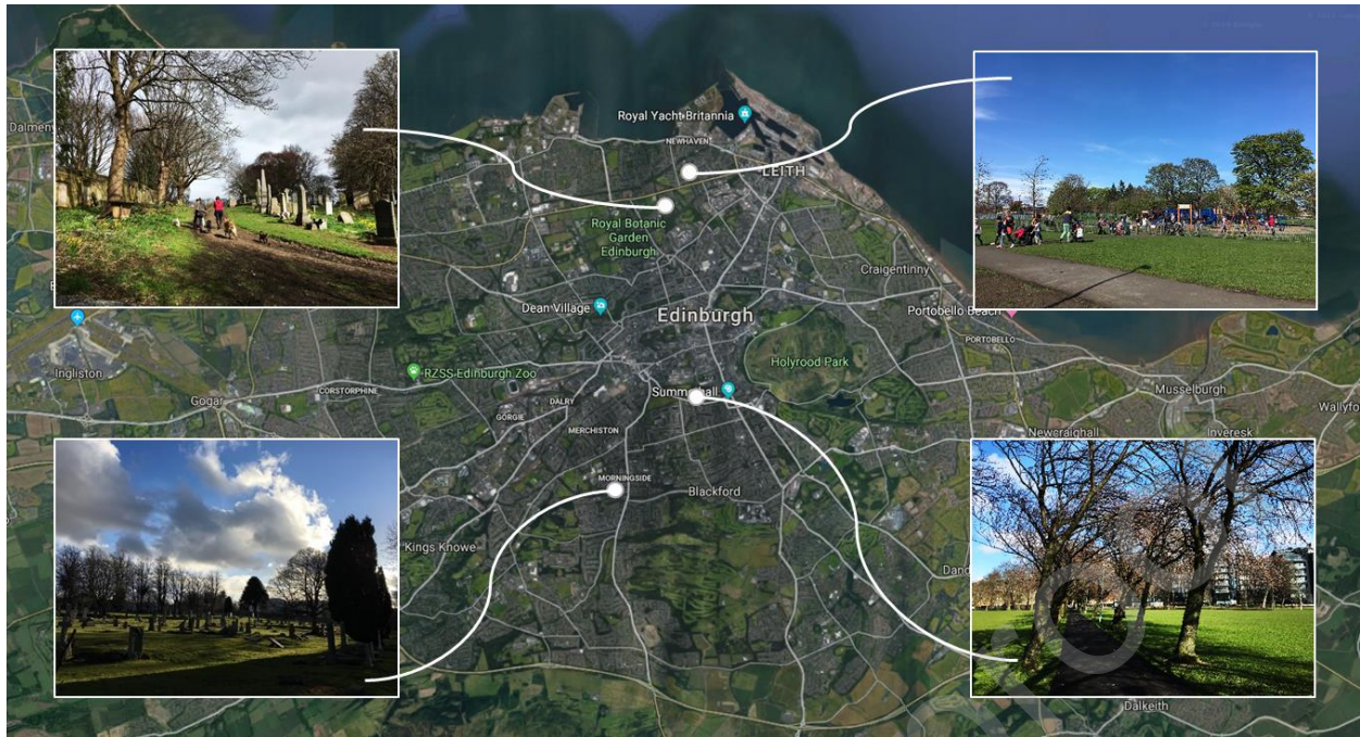
Figure 1. The map of Edinburgh and images of the four study sites.

Note. Warriston Cemetery (top left); Victoria Park (top right); Morningside Cemetery (bottom left); Meadows (bottom right).