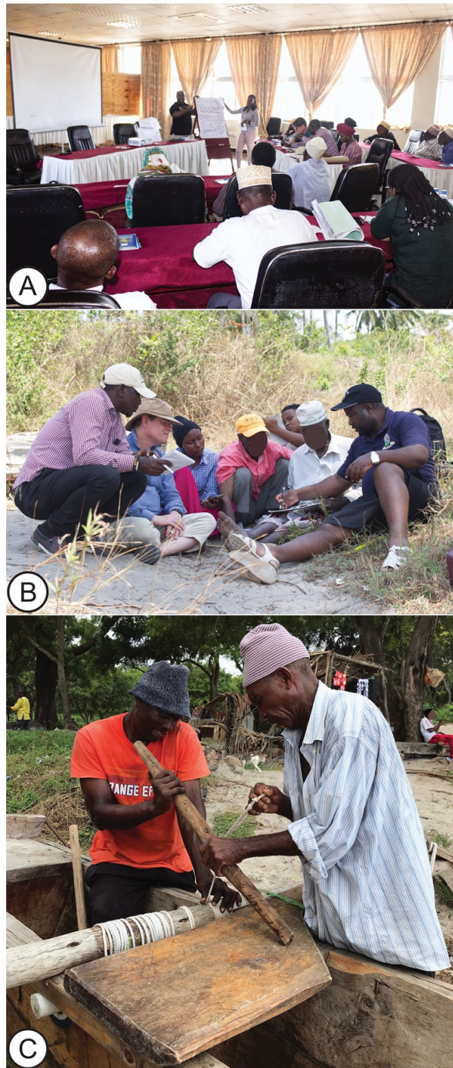
Figure 7. Co-creative practices between academic researchers and practitioners included: (A) an initial research co-creation event; (B) ethnographic interactions, including participatory mapping (under way in this image); (C) observation of activities and concurrent interview.