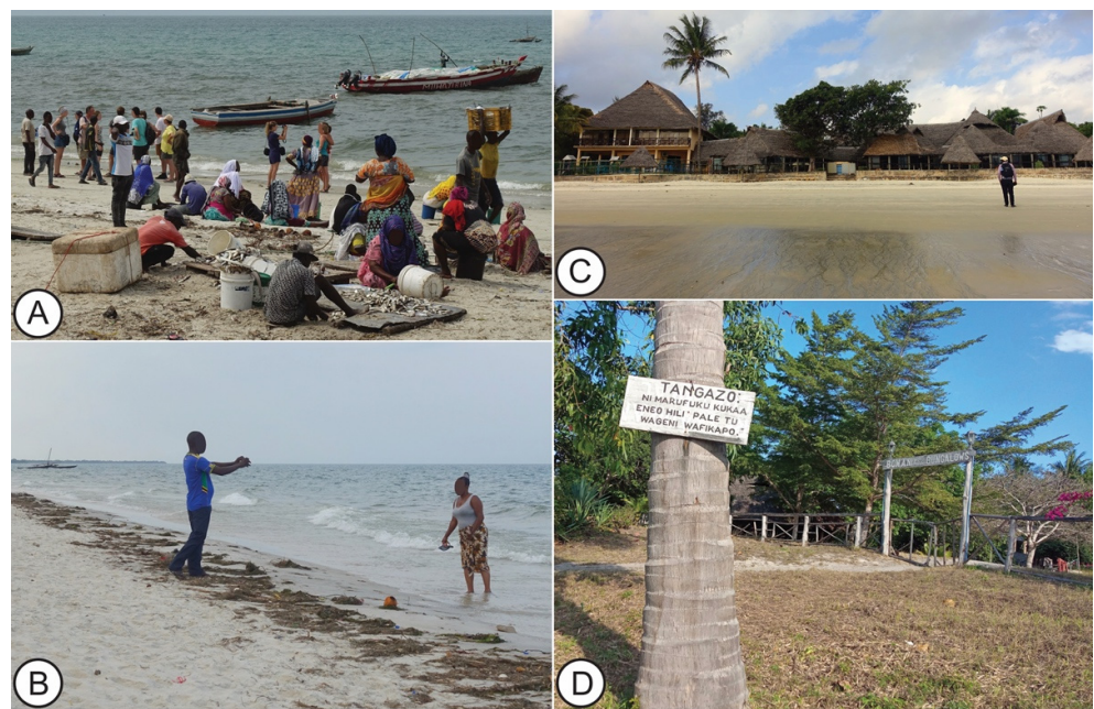
Figure 10. Aspects of tourism in Bagamoyo and environs: (A) Western tourists are guided through the heart of the working beach at Bagamoyo; (B) a couple record an evening on the beach; (C) a beach-front hotel at the south end of Bagamoyo’s waterfront—note the absence of fishing or boat-building activities; (D) a sign in Swahili outside the Bomani Bungalows hotel in Mlingotini claims “It is forbidden to stay in the [beach] area when guests arrive”.

The relationship between maritime practitioners and tourists in Bagamoyo can be frosty, nevertheless. A sign facing the beach outside one waterfront hotel in Mlingotini—written only in Swahili—told its readers to make themselves scarce, should guests seek to use the beach (Figure 10D). The menu of another in Bagamoyo proudly informed its guests that it did not sell local fish, citing unsustainable fishing practices. Meanwhile, direct interactions between tourists and local marine practitioners remain limited: while tourists surveyed by the project showed a keen interest in boat trips (Table A1), there were few obvious opportunities to experience these. Meanwhile, there exists a chasm of misunderstanding between tourists seeking to photograph people at work on the waterfront and practitioners themselves: the latter often resent the intrusion and objectification.