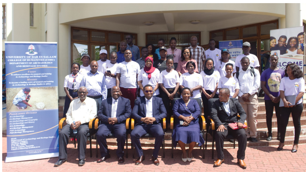
Figure 13. Delegates at the stakeholder workshop held at the University of Dar Es Salaam, December 2020.

Finally, it was not a credible aspiration of the BYUW project to influence national decisions on whether or not to proceed with the BSEZ scheme. Indeed, the project appeared to have been shelved at the time of our fieldwork. Nevertheless, our co-creative work in Bagamoyo has succeeded in documenting, to some extent, a heritage tenured within a landscape that may soon disappear as a result of that scheme. It is to be hoped, moreover, that the heritage-affirmation work that we have carried out, alongside our engagement with national policymakers, might contribute to a process by which the tenured practices and material cultures of coastal communities is more actively considered by planners and policymakers across a range of sectors in future.