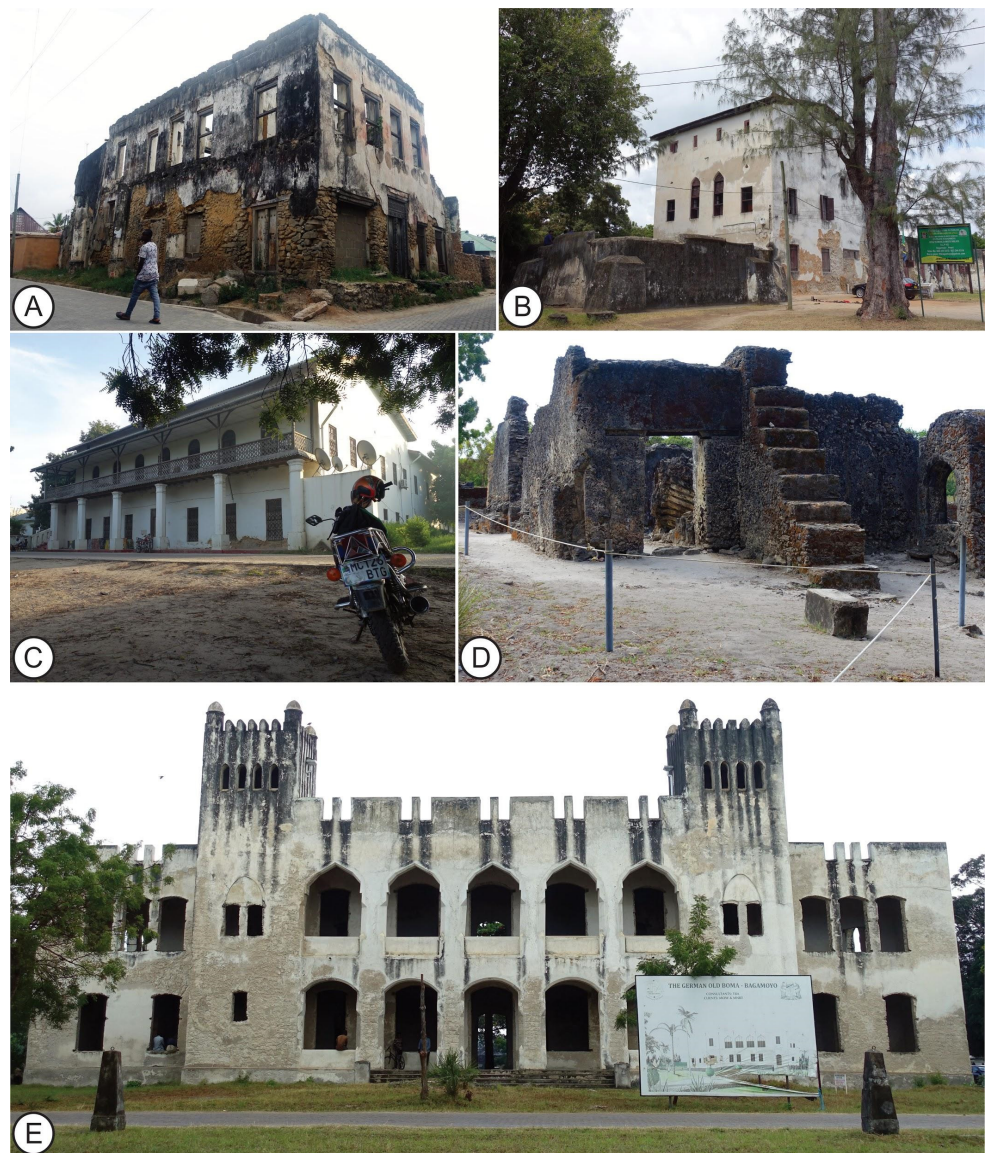
Figure 2. The built—and legally protected—heritage of Bagamoyo and district, 2019–2020: (A) a derelict 19th century house in the Stone Town district; (B) the town's Arab–German fort, a ticketed visitor attraction; (C) the Arab Tea House, now government offices; (D) the ruined 13th-century mosque at the Kaole archaeological site; (E) the 19th-century German Old Boma building, venue for the Bahari Yetu, Urithi Wetu project's community exhibition.

built tombs, the German cemetery, and the hanging place, where local chiefs were executed during the resistance wars. Most of these enjoy formal protection under Tanzanian antiquities law and are visited by tourists. Nevertheless, many structures are in a state of collapse through abandonment or lack of maintenance: Over 80% of buildings on the town's Indian Street have already disappeared [27]. Those surviving best have ticketed entry—such as the Fort (Figure 2B) and Caravanserai—or have found alternative uses as administrative buildings (such as the Arab Tea House (Figure 2C)), restaurants or hotels. The history and condition of this built heritage has been examined by several scholars in recent years [1], ([4], p. 56), [24,27–29]. Yet, for most residents of Bagamoyo, such structures are marginal to their daily lives.