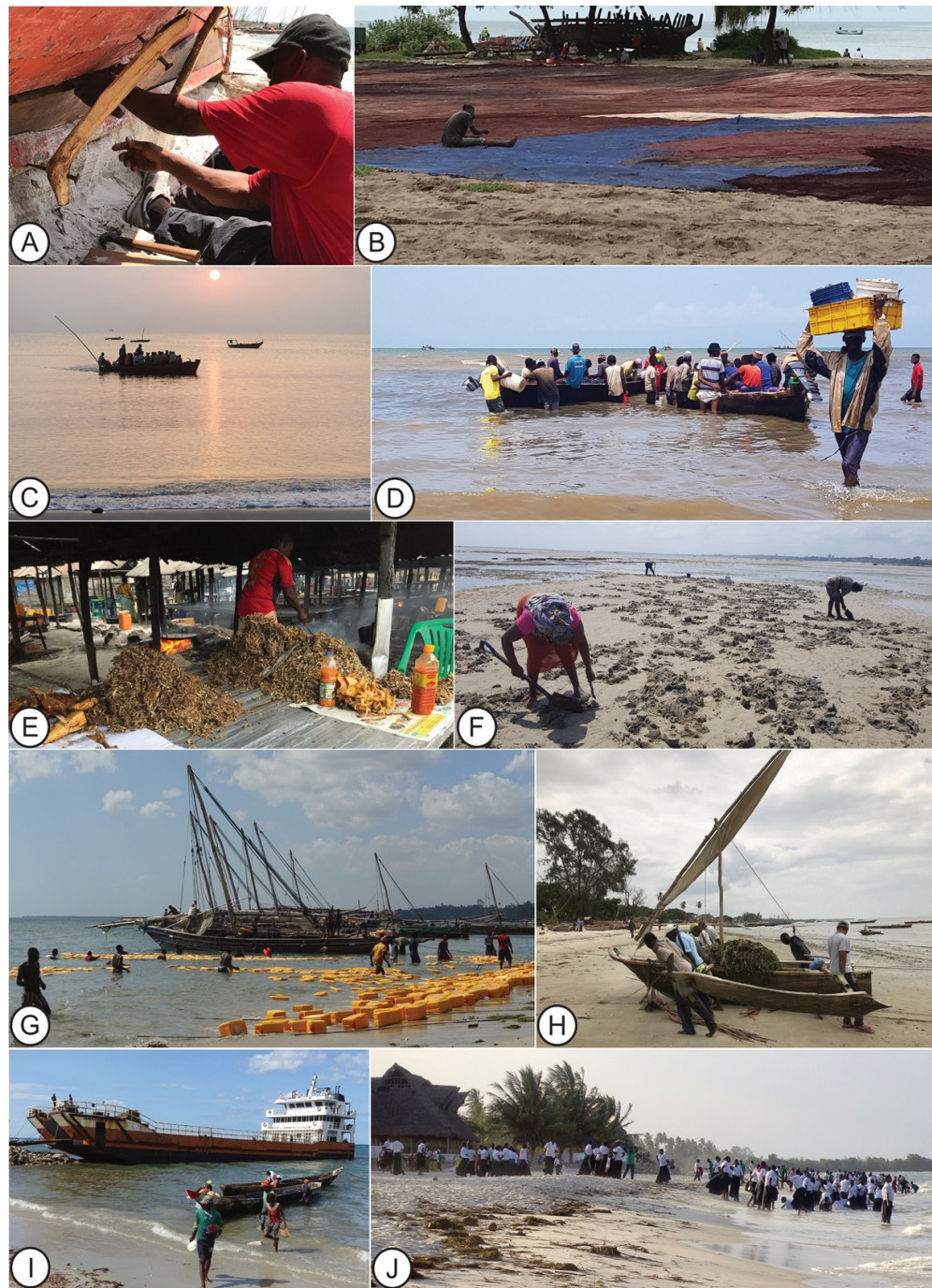
Figure 3. The contemporary—and legally unprotected —maritime cultural ‘heritage’ of Bagamoyo and district, 2019–2020: (A) a boatbuilder makes repairs to a ngwanda fishing boat; (B) a man repairs a purse-sein net on the town’s football pitch; (C) the crew of a motorised boti la mtando prepare to depart to fishing grounds with the rising sun; (D) porters carry the catch ashore from arriving mtumbwi logboats; (E) I fish frying and selling under shelters at the head of the beach—the district council cleared and relocated these during the period of the project; (F) women collect sea cucumbers (Sw. majongoo (sing. jongoo )) for export to East Asia; (G) porters land a cargo of cooking oil brought by mashua cargo vessels from Zanzibar; (H) fishers drag a ngalawa logboat up the beach for overnight storage; (I) the bulk-cargo ship Samarra II , which carries aggregates between the mainland and Zanzibar; (J) a school visit to the beach.