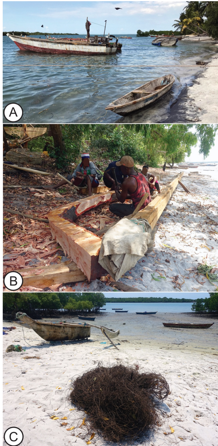
Figure 9. Areas of the Mlingotini Lagoon that would be affected by the Bagamoyo Special Economic Zone project include the waterfront and anchorage at Mlingotini village (A), where boatbuilding (B) also takes place; and (C), the Bandari ya Poteza haul-out and mooring area.