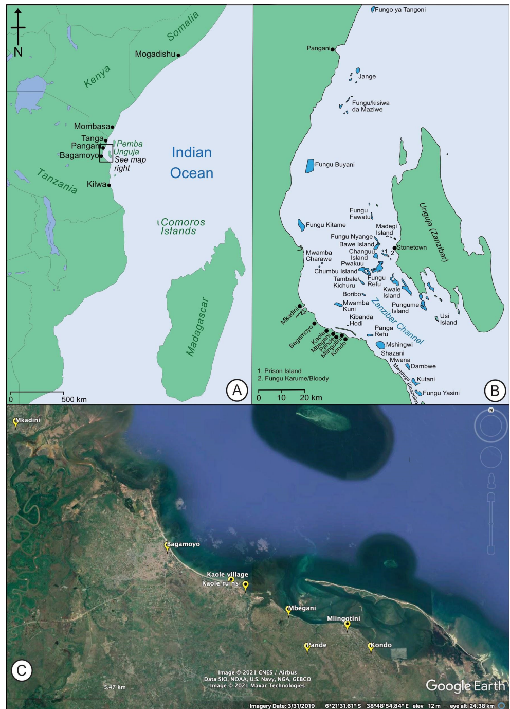
Figure 1. Locator maps showing (A) the location Bagamoyo on the East African coast; (B) Bagamoyo and nearby villages mentioned in the text, together with fishing areas within the Zanzibar Channel identified by members of the fishing community through collaborative mapping; (C) close-up of coast around Bagamoyo and the Mlingotini Lagoon, showing locations mentioned in the text. (Images: John P Cooper; contributors to the collaborative mapping exercise; Google Earth).

To date, formal heritage professionals have largely conceived of and addressed Bagamoyo's heritage through its built environment, particularly the numerous, mostly 19th century C.E., buildings of its central 'Stone Town' area (Figure 2A–C,E), as well as the 13th–16th century C.E. standing ruins at Kaole, some 5 km southward along the coast (Figure 2D). Also important within Bagamoyo are the 17th century Mwanamakuka stone-