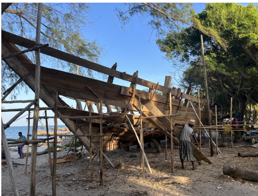
Figure 12. One of the boats under construction by members of the CHAMABOMA-Bagamoyo boat-builders' collective, which was founded with the assistance of the BYUW project.