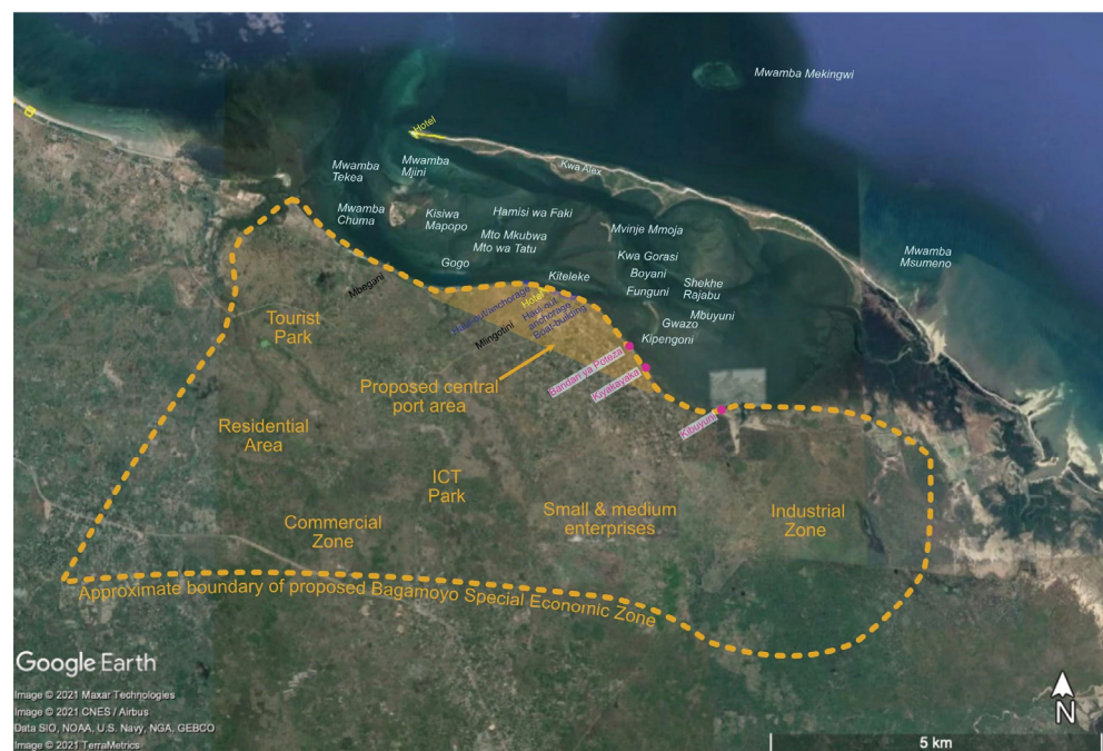
Figure 6. Remote sensing image of the Mlingotini Lagoon, marked up to show the approximate scale and zoning of the proposed Bagamoyo Special Economic Zone (in orange), the current anchorages and haul-outs of Mlingotini village (in dark blue), nearby fishing haul-outs (in magenta), and the names of current fishing areas within and outside the lagoon (sky-blue italics).

Bagamoyo's complex and multi-faceted maritime patrimony has faced upheaval in recent years as a result of central government plans, first promoted by former President of Tanzania Jakaya Kikwete (2005–2015), to build, at a cost of some USD 10bn, the massive BSEZ, comprising a vast modern seaport and associated industries, retail and tourist developments, as well as a new hospital, all centred around the Mlingotini Lagoon, just to the south of Bagamoyo [34,35], ([36], pp. 6–7,15), [37,38] (Figure 6). This mega-project, backed by Chinese and Omani investment, was the subject of a framework agreement witnessed in March 2013 by President Kikwete and Chinese president Xi Jinping. The scheme went into abeyance after President Kikwete left office, but was revived under President Samia Suluhu Hassan in mid-2021 [39]. Its advocates point to the many employment opportunities and potential for regional and national economic growth that this scheme offers: it would, in the process, impact a huge section of coastline around Bagamoyo, as well as a swathe of the Zanzibar Channel that would constitute its maritime approaches. It would disrupt the activities of fishers and intertidal gatherers in particular, as well as the customary movement of fishing and cargo vessels within the Channel.