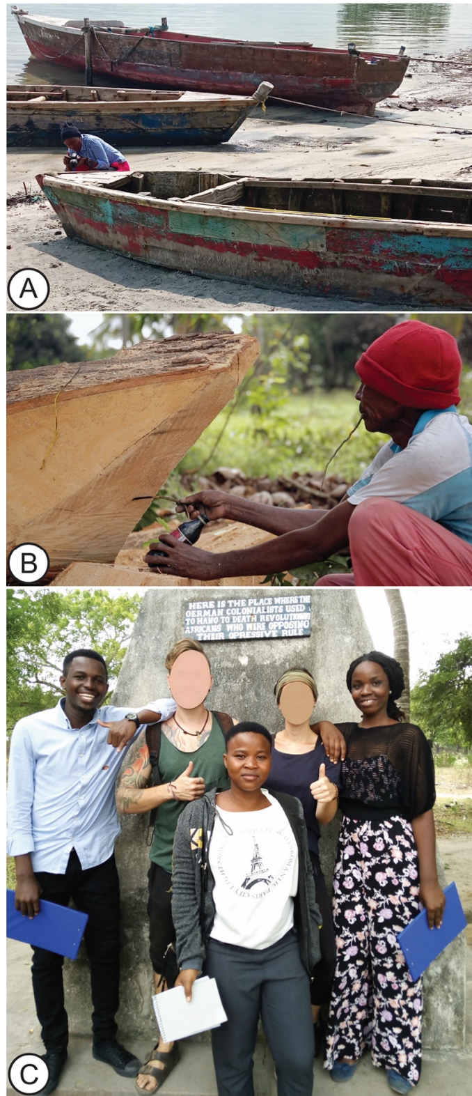
Figure 8. Data-gathering activities included: (A) photogrammetric recording of watercraft types; (B) video recording of construction methods; (C) UDSM undergraduate students conducting a survey on tourist attitudes to the sea, February–March 2020.