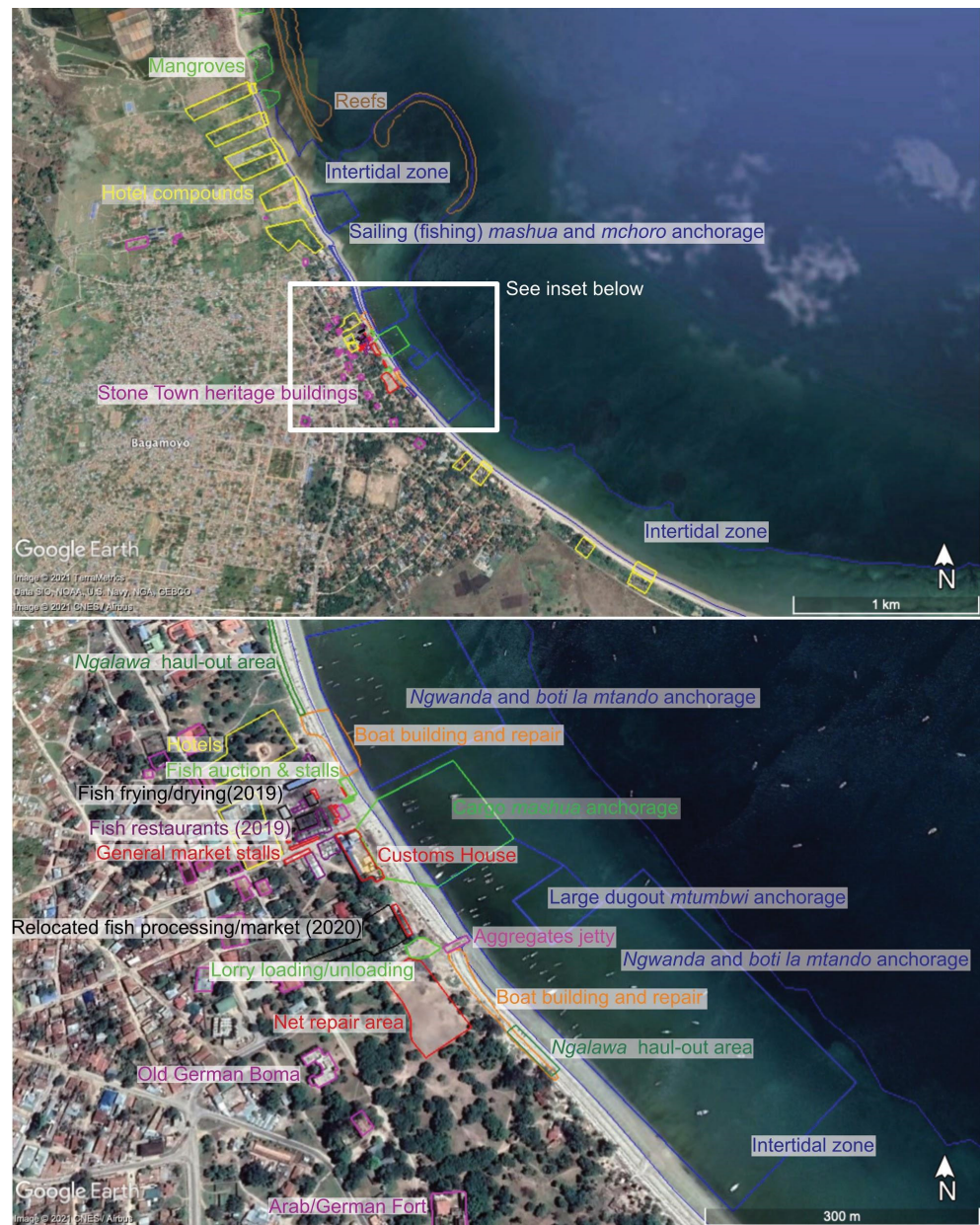
Figure 5. The principal maritime ‘heritage’ spaces of Bagamoyo, as observed during the Bahari Yetu, Urithi Wetu fieldwork. The solid lines outlining anchorages are indicative of zones that, in reality, blend into each other.

Boatbuilders also work along the beach. Quick mends might be completed in the intertidal zone when the tide is out, but more extensive repair and building work is normally conducted at the head of the beach. Further inland, forest and bush offer opportunities to source timber for the construction process, extending the reach of the maritime cultural landscape. If ‘heritage’ has meaning to the maritime community of Bagamoyo, then it is, crucially, through this spatiality.