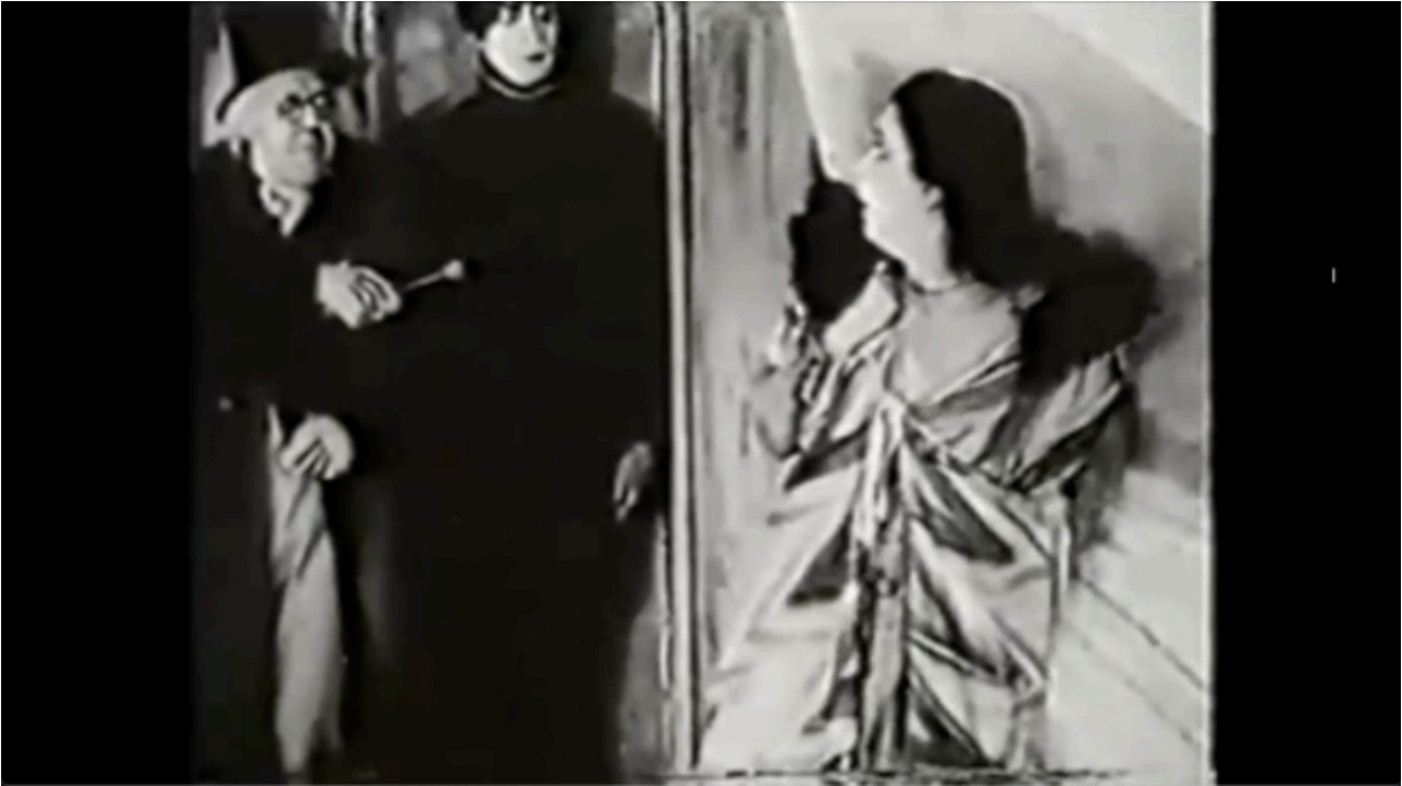
Figure 14: Jane witnesses the awakening of Dr. Caligari's somnambulist at 26:18.

Church bells are used at 26:32 to accompany the funeral while reciting a melody heard within the love theme. This scene, despite its morbid overtones, acts as an exceptionally brief respite from the clear threat present in both previous and future scenes. For this reason the decision was made to keep the sound world clear and unambiguous with eerie string instrumentation to build a sense of tension. The only other sound heard besides church bells and the projector reel, is that of crow calls which are typically used to represent death due to their presence in folklore and interest in carrion.