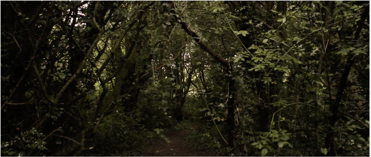
Figure 3: Still from A (Dom Waldock - Music, 2018) showing the forest path at the beginning of the film.

For the sound design and music composition entitled A1 , I decided to focus on the three sections sonically to coincide with the changes on screen. Although the whole film takes place within the wood, it seemed important to trigger a clear tonal change upon discovery of the clearing so that its purpose seemed more uncertain to viewers. The propensity of people's relationship with the idea of walking through an area such as this could be seen to relate often on a nostalgic level. Forests have throughout history acted as pathways from one place to another that bring along with them the true enjoyment of exploring the beautiful and tranquil aspects of nature. However this is juxtaposed with the idea of the unknown which will beckon us away from the path. These themes have maintained their importance through the numerous and repeatedly relevant adaptations of old folk stories such as Little Red Riding Hood.