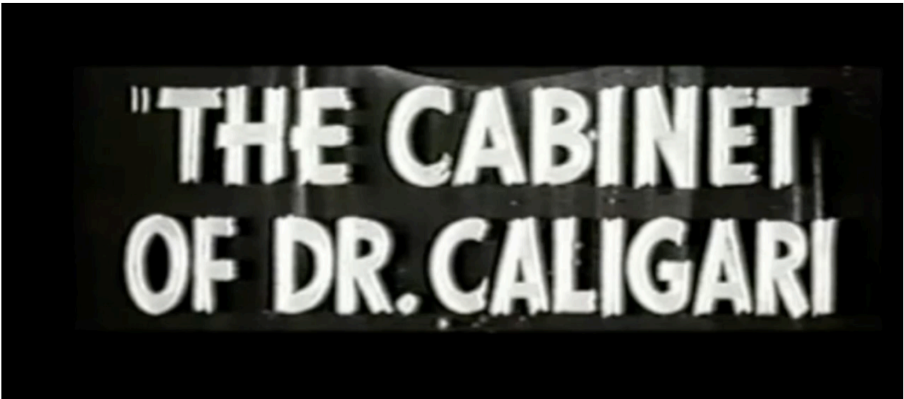
Figure 6: The opening title credits from The Cabinet of Dr Caligari - A Sonic Reimagining (Dom Waldock - Music, 2020) at 00:00.