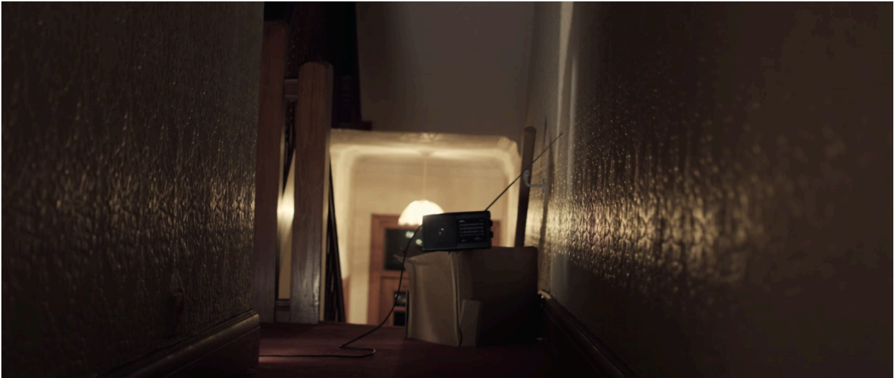
Figure 2: Still from B showing the gradual camera movement away from the radio.

At 0:33, what can be regarded as the first clearly non-diegetic sound is introduced. A sudden low frequency noise hits and resonates for approximately fifteen seconds. This was produced by lowering the pitch of a double bass plugin beyond normal range, adding tape delay and heavy reverb. Until this point, the frequency range in B1 is based entirely on middle pitch and high pitch sounds, further accentuating the impact of the double bass “boom”. The placement of this “boom” does not correlate with any visual development. This decision was influenced in part by the work of Japanese composer Toru Takemitsu on the soundtrack for Masaki Kobayashi’s Kwaidan (Ghost Stories) (Kobayashi, 1965). Simington quotes Takemitsu directly as saying that he, “wanted to create an atmosphere of terror. But if the music is constantly saying, “Watch out! Be scared!” Then all the tension is lost. It’s like sneaking up behind someone to scare them. First, you have to be silent.” (Simington, 2018). Although the double bass “boom” is not preceded by silence, there is a clear absence of non-diegetic and lower frequency sound. This, combined with a lack of narrative change to prepare the viewer for any sonic changes, ultimately determined its placement at 0:33.