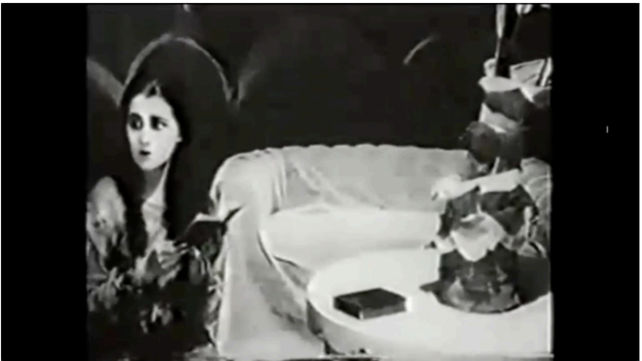
Figure 13: Francis and Alan discuss their mutual romantic interest in Jane at 23:27.

If the fictional antagonist can be portrayed to have influence, however slight, on the mechanical restraints of 1920s camerawork, then his reach has the potential for translation to present-day cinema. It is upon this 21st century researcher to reinvent the way The Cabinet of Dr Caligari (Wiene, 1920) is perceived whilst attempting to retain its horror elements. One could argue that expanding the perspective of a filmgoer in 2020 beyond the confines of simply watching a century-old film confined to its historical and technological limits, is crucial , if aiming to achieve a full cinematic horror experience. The classification of blemishes in the film's visuals and the addition of diegetic sound to a prominent work of the silent era are two key ways in which I have endeavoured to do this.