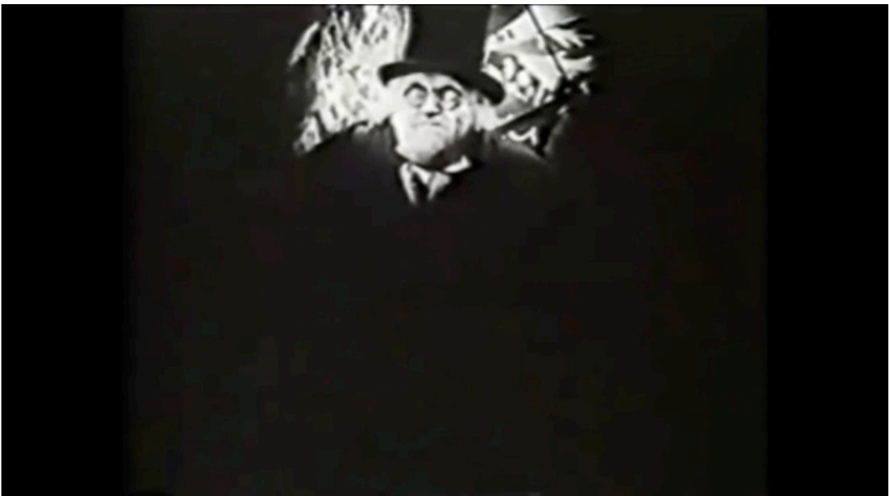
Figure 7: The vignette reveal of Dr. Caligari at 02:55.