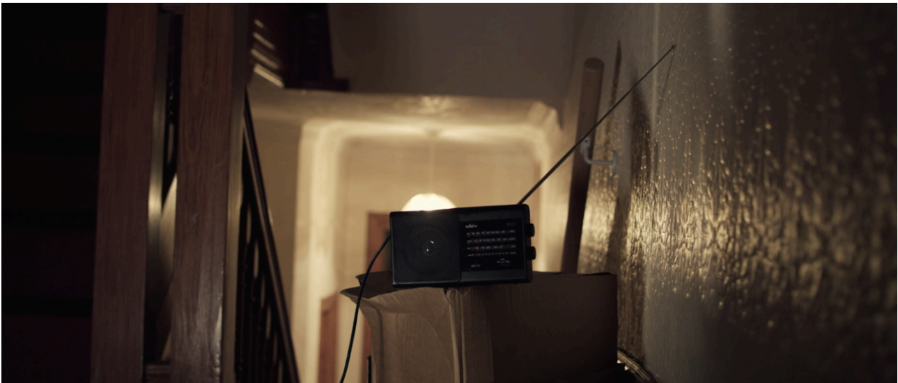
Figure 1: Still from B showing the interior location, and radio as the focal point.