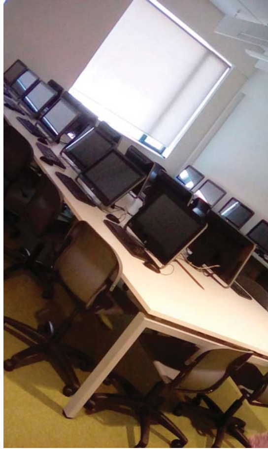
Image 7. The sixth form computer room.

Year 12 Girl 1: well, unless you are in that big group of kids that kind of rule it. It is kind not really for you, it's kind of intimidating.