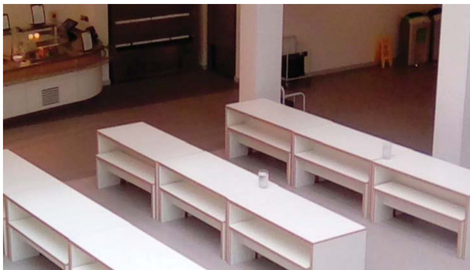
Image 2. Tables in the atrium.

The atrium was intended as an inclusive space where all, including teachers, would eat and socialise together, but there were some limitations to this. Furthermore, some students expressed reservations over how the atrium would be used as the school grew, and about the constant visibility of people within the atrium space.