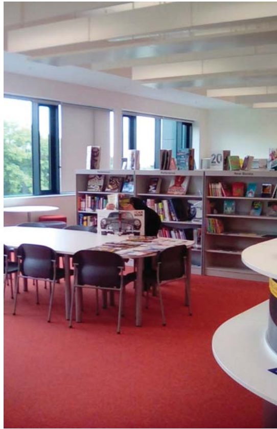
Image 4. Inside the library.

Others similarly focused on the library as a quiet space: