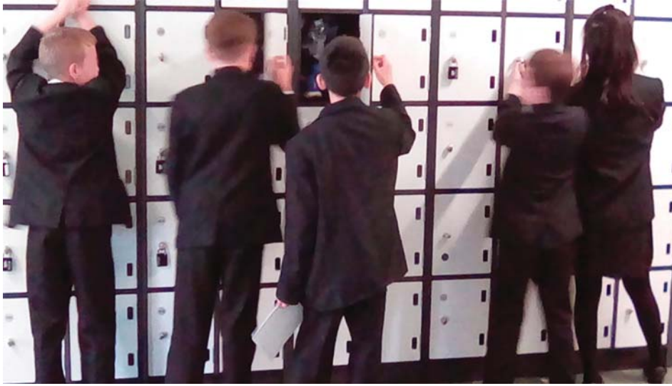
Image 5. A group of students in front of the lockers.

Year 7 Girl 3: you can also think it from a different point of view, because lots of us hang out around the lockers a lot. So then there is a lot more memories there.