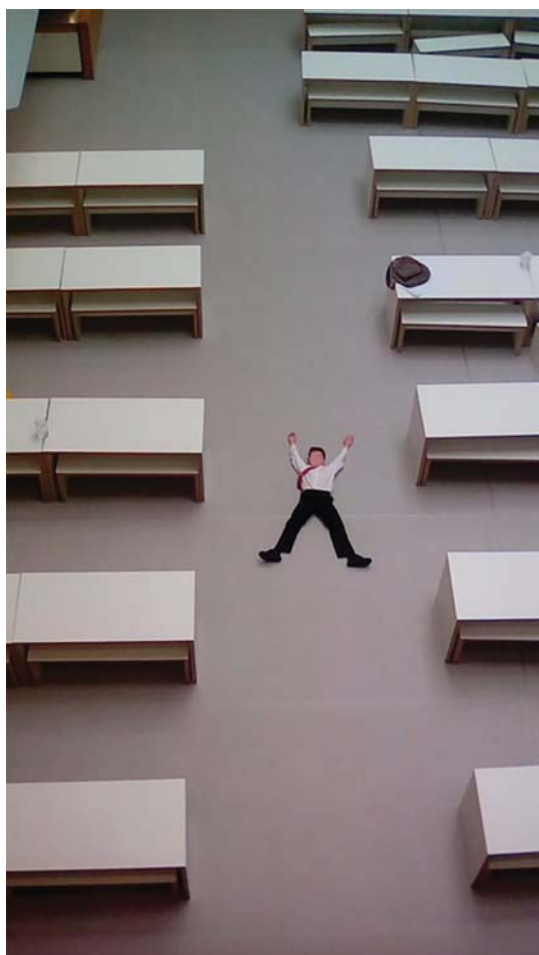
Image 1. Student in the atrium.

I decided to take the photo to highlight, because he’s got his arms spread out, to show how much space there is. And you can sit anywhere really (Image 1, Year 7 Boy).