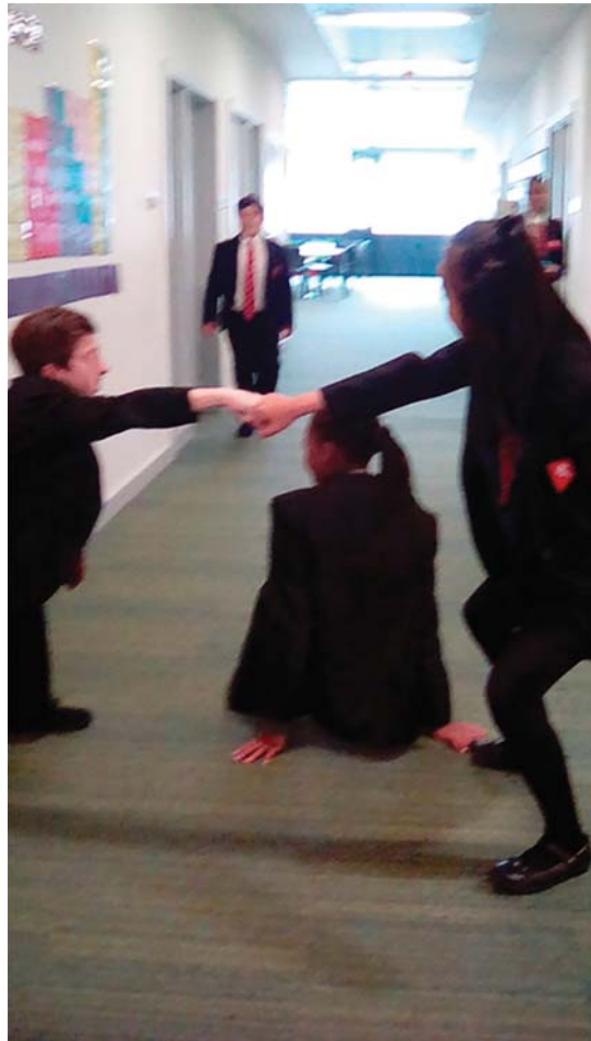
Image 6. A group of students interacting in the hallway.

We do a lot of work there and of course, the sixth form room is kind of our freedom area, because there aren't a lot of instructions there (Year 12 girl).