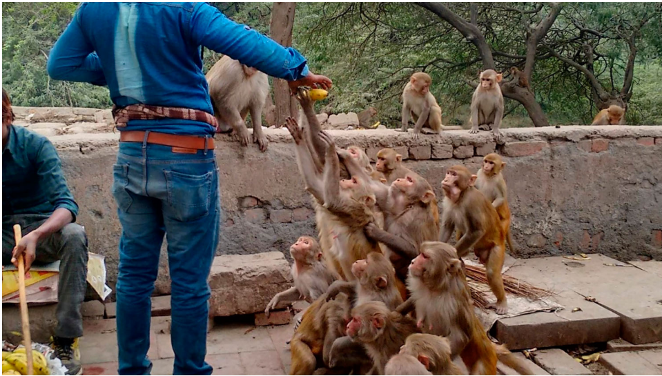
Figure 3. Provisioning macaques. The makeshift stall of a banana vendor is on the left.

10,000 animals but, as an official remarked, “the problem does not show signs of ending anytime soon” (Anon., 2010). To date, over 20,000 macaques have been captured and relocated, but the municipal agency has begun to concede defeat, claiming that in their battle with macaques, “the simians seem to have won” (Anand, 2012, no page). Capture has led to other macaque troops moving into evacuated territories, including previously unused areas of human habitation. Individuals have even learnt to get the better of traps. As a result, monkey-catchers are reticent to take up MCD contracts. Everyday practices of offering food continue unabated, some devotees even stating they are willing to pay fines, but nothing can come in their way from appeasing Hanumān or following astrological remedies. Behavioral adaptations of the rhesus and its everyday alliances with people thus successfully subvert State logics and its attempts to control wild life.