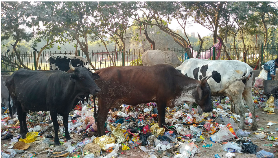
Figure 1. Urban cattle grazing in a garbage heap.

Human labor is, however, only part of this story of social reproduction. Cattle, one can argue, are invisible workers in such informal economies, which tap into the “metabolic work” (Barua, 2018b) the animals perform. Often left to fend for themselves, cattle in Delhi graze amidst the ruins of capitalism: frequenting ephemeral garbage heaps, municipal waste collection depots and landfills, and foraging on the detritus of commodities (Figure 1). Bovine bodies and their metabolism, therefore, become conduits through which waste re-enters circuits of value. Furthermore, as our fieldwork reveals, the presence of urban dairies spawns a whole other set of economic practices in the city. Many waste-pickers, working in the highly informal and precarious waste sector, salvage vegetables and half-consumed food to sell onto dairy owners, who use such material as cattle