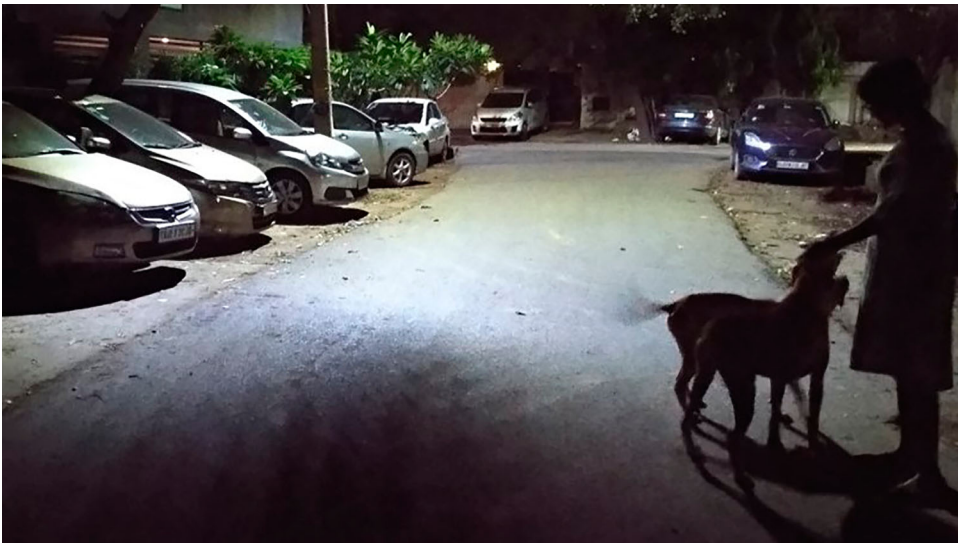
Figure 2. Street dogs in a residential neighborhood eliciting affection from a human.

We might extend this perspective further by turning to relations between street dogs and the material environment. Whilst cattle track a pastoral topography of the city that is