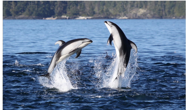
Fig. A1 Two Pacific white-sided dolphins ( Lagenorhynchus obliquidens ) leap during a bout of foraging activity near the Broughton Archipelago, British Columbia, Canada.

Supplementary Information The online version contains supplementary material available at https://doi.org/10.1007/s42991-022-00236-4 .