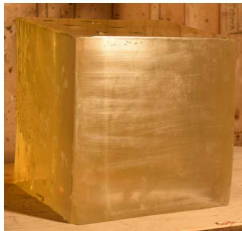
Figure 1. 10% ballistic gelatine [17].

Regardless of which construct of ballistic gelatine is used, the shelf life remains poor [14,15]. Polymer-based gels, such as the brain tissue simulants Sylgard and Styrene-Ethylene-Butylene-Styrene (SEBS), which is a thermoplastic elastomer [19], have been developed to provide a suitable alternative with similar performance properties to those of ballistic gelatine to measure behind-armour blunt trauma and back-face deformation. This may eliminate storage requirements and alleviate shelf-life issues; however, the existing issue of manufacturing variable control remains of concern for survivability.