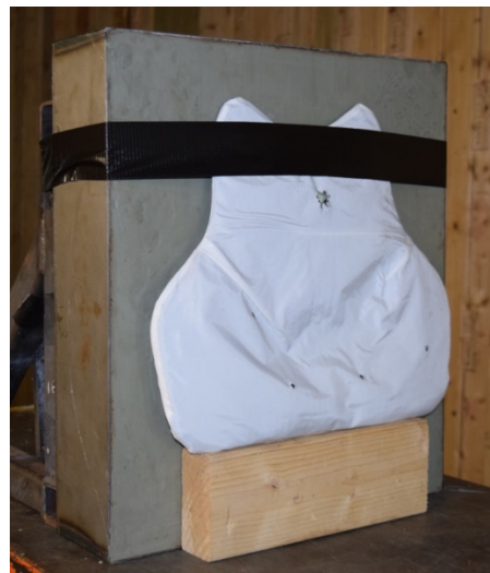
Figure 4. Roma Plastilina No. 1 used as a backing material for survivability assessment [17].

The protective material is located centrally to the front face of the Plastilina and secured to minimise movement; this is highlighted in Figure 4. Once testing has been completed, the protective material is removed from the front face of the Plastilina, and any depth of indentation is measured using a vernier calliper or another agreed-upon method [17]. It should be noted that, because of the construction of Roma Clay, the mixture equates to roughly twice the density of human tissue and is thus used as a worst-case testing material [31].