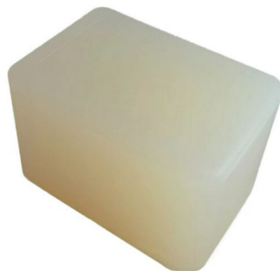
Figure 3. Ballistic soap [25].

Unlike gelatine, ballistic soap has a much longer storage life (a number of years as opposed to days) [11]; this is predominantly due to the complex glycerine manufacturing process, which means the material is purchased by the researcher as opposed to being made on site. Prior to any data capture, the material should undergo baseline testing to ensure that viable performance is shown and that a comparison can be made with previous/future blocks. However, as these are not reusable materials, nor are they transparent, the opportunity to realise cost savings and use high-speed video footage to analyse results is limited.