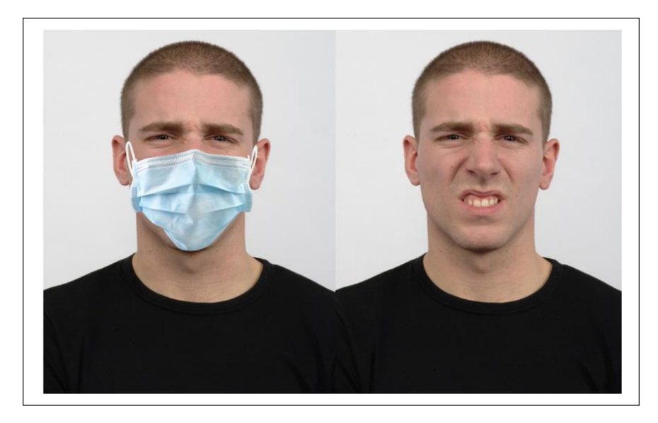
Figure 1. Example stimuli (left masked, right unmasked), with both images of a model presenting the emotion of disgust.

Smithson, 2020). Langner et al.'s (2010) study also validated the facial stimuli to ensure that facial expressions of emotion were of average intensity. As part of Langner's validation study of the Radboud Database, participants were asked to rate each face, on a five-point Likert-type scale ranging from weak to strong, regarding the intensity at which each emotion was facially expressed. As emotions tend to be facially expressed with average intensity within typical everyday interactions (Motley & Camden, 1988), this study utilised face stimuli where emotions were deemed to be expressed with average intensity as validated by Langner et al. This study also utilised 12 models to present emotions acceptably within one standard deviation of the intensity judgements from all 57 models, while also having a high emotion agreement, in accordance with Langner's validation of the Radboud Faces Database. See Figure 1 for an example of a model expressing disgust both with and without a mask overlay.