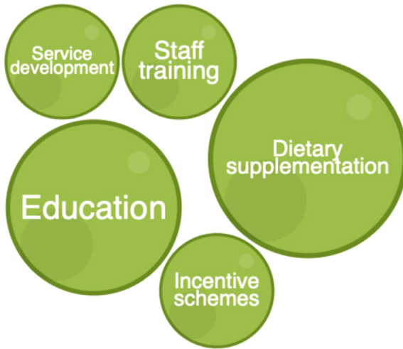
FIGURE 2 Types of antenatal interventions in included studies

This bubble diagram illustrates the types of antenatal intervention reported in included studies, with the size of the bubbles proportional to the number of studies. The biggest category of intervention was dietary supplementation, with 9 studies focusing on micronutrient supplementation or other dietary changes.