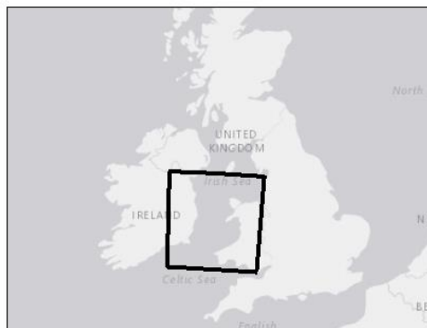
Figure 1: Map of CCAT project case study communities of Fingal, Ireland and Pembrokeshire, Wales.

Includes data reproduced courtesy of Ordnance Survey Ireland Open Data and Ordnance Survey UK Boundary-Line™ Service Layer Credits: Esri, HERE, Garmin, (c) OpenStreetMap contributors, and the GIS user community