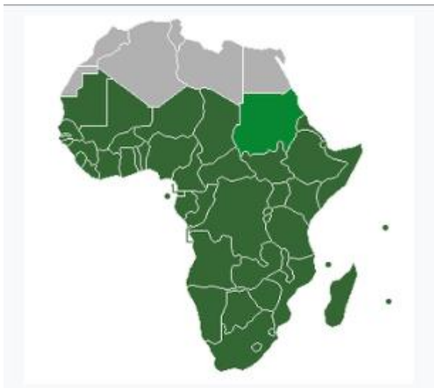
Map 1: Sub-Saharan Africa.

Non-communicable diseases (NCDs) are the most common causes of mortality and morbidity worldwide, responsible for 71% of all deaths and 80.6% [649 million] of the number of years lost to disability (Vos et al., 2017). They pose a major threat to sustainable development as they are the leading cause premature mortality globally and are an important driver of poverty (Naghavi et al., 2017). The United Nations through target 3.4 of the sustainable development goals (SDG) aim to decrease premature mortality from NCDs by a third by the year 2030 through prevention and treatment and by promoting mental health (United Nations, 2015). Despite the significant decrease in global disability (Hay, 2017; James et al., 2018; Vos et al., 2017) and deaths (Naghavi et al., 2017) due to HIV/AIDS, malaria, and other communicable diseases, total deaths from NCDs have continued to rise (Naghavi et al., 2017). Cardiovascular diseases (CVDs) are the most common causes of NCD-related deaths (Naghavi et al., 2017). It is projected that by the year 2030 these NCD deaths would encompass an estimated 52 million people (World Health Organization, 2014). Annually, about 75% of all NCD-related mortality and 80% (16 million) of premature deaths occur in low- and middle-income countries (LMIC) (WHO, 2021).