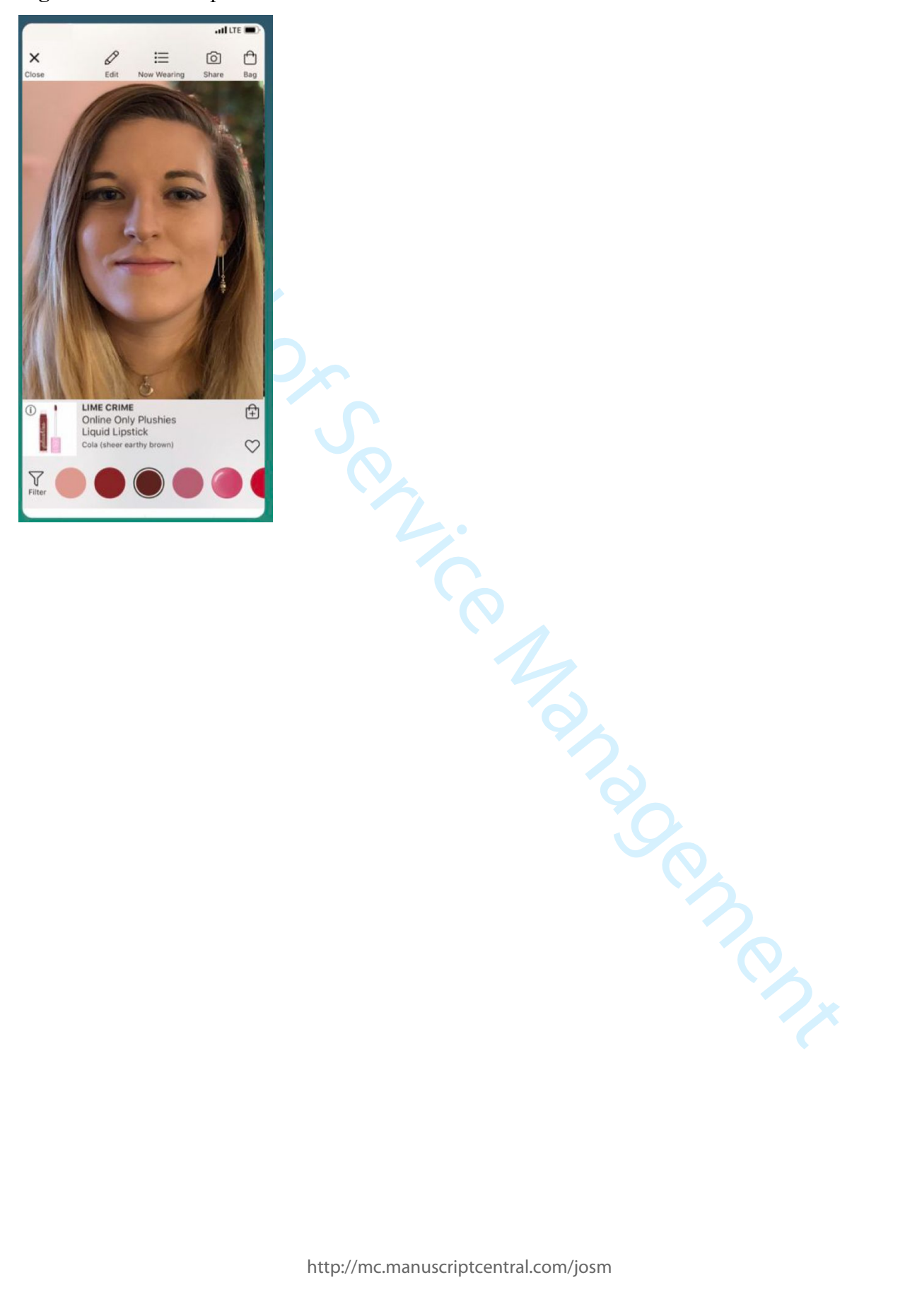
Figure 1. AR Makeup