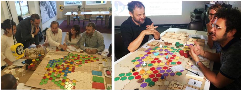
Fig. 2. Images of the play sessions of Energy Safari (left) and Mobility Safari (right). The colors of the tiles indicate different project types and special zoning (e.g. urban development zones, Transport Oriented Development hotspots).

built around energy projects addressing the urban/regional scale and the narrative of Mobility Safari is built around mobility projects focusing on the city scale. In spite of the differences in theme and scale, both are supported by a similar interface, as Figure 2 illustrates.