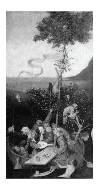
Fig. 1. Hieronymus Bosch, Ship of Fools (1490–1500)