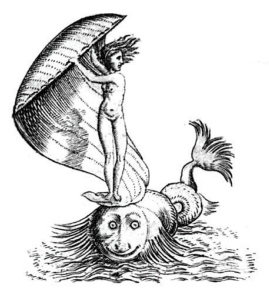
HIC SVNT MONSTRA