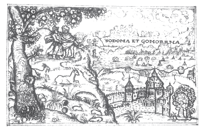
Fig. 1. San Marino, с.А., Huntington Library, мs нм 121, fol. 6г. (detail)