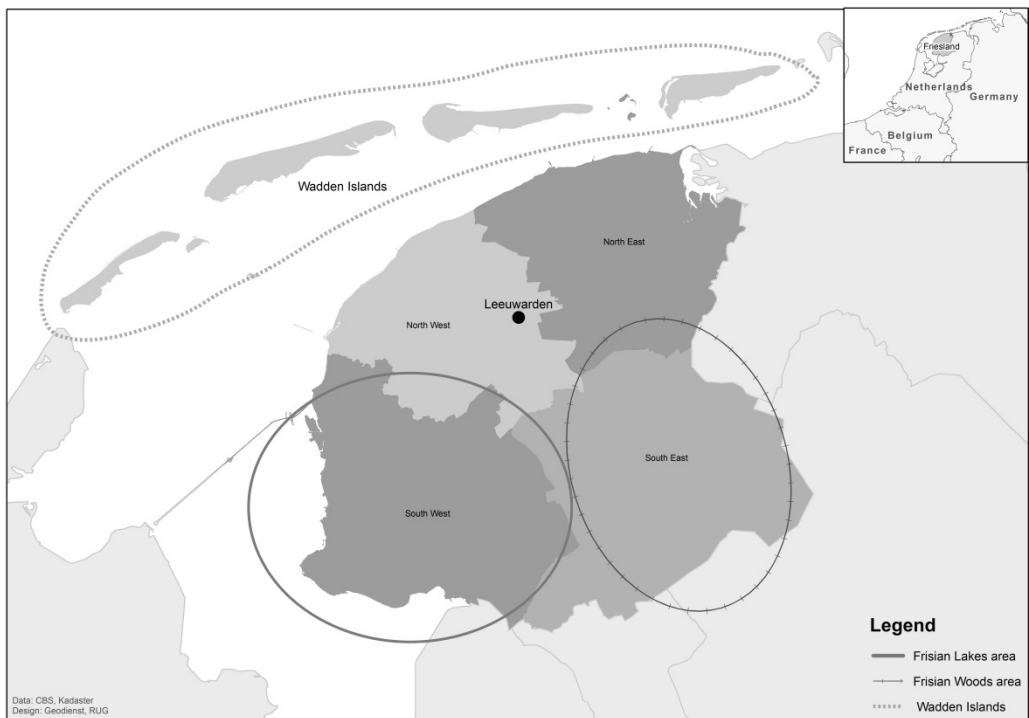
Figure 4.2 Tourism areas and policy regions in Fryslân.

Residents of the Province of Fryslân registered as respondents with Partoer, a socio-economic research organization, were invited to fill out an online survey. A convenience sampling approach was used, as registration with the panel and participation in this specific survey were voluntary. While this could result in overrepresentation of people intrinsically motivated to fill out this survey, or to communicate their opinion on regional issues more generally, we deemed the convenience sample suitable for our conceptual analysis of relations between destination attractiveness,