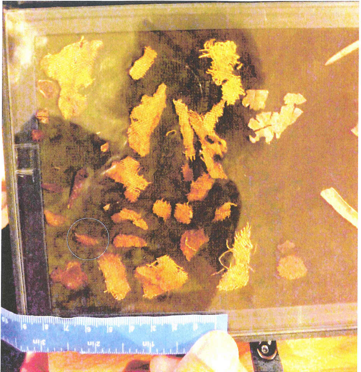
Figure 54. Temple Scroll wrapper, small frame with textile piece taken for radiocarbon dating highlighted

The fragments of the Temple Scroll wrapper are particularly useful for radiocarbon dating because, unlike many textile fragments from the Qumran caves, they have never been cleaned or treated, so that there are no modern contaminating residues that would influence radiocarbon dating results. They appear to have been bleached in antiquity (cf. Sukenik, p. 342). Since these small fragments were already separated from the larger piece they proved to be ideal for radiocarbon dating, as no cutting is required. Martin Schøyen kindly permitted one of the present authors, Joan Taylor, to take a piece for dating by the Centre for Isotope Research, Groningen, and this was sent to the laboratory on 17 December, 2014 (Figure 54 shows the piece chosen).