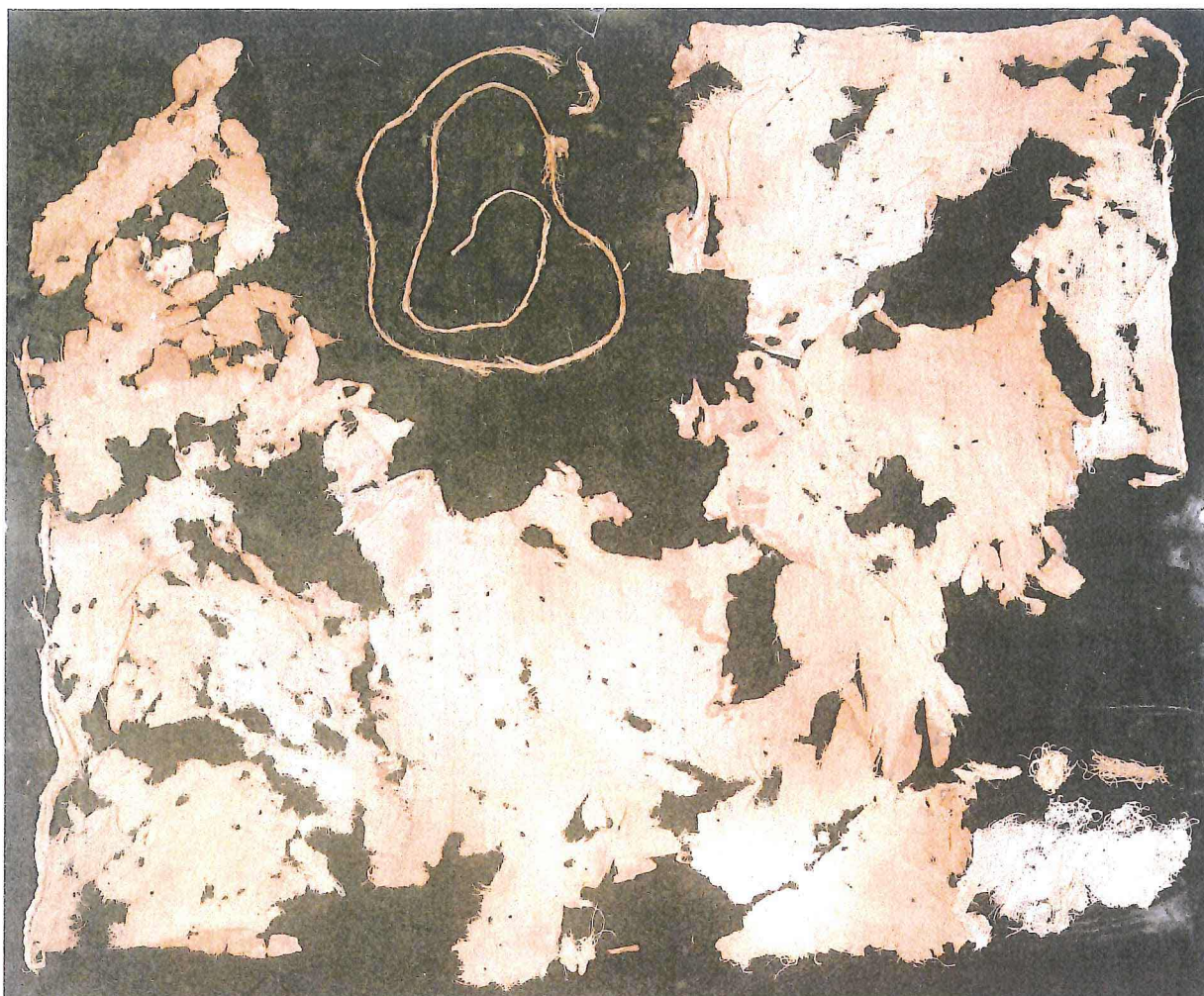
Figure 53. Temple Scroll wrapper (scale 1:4)