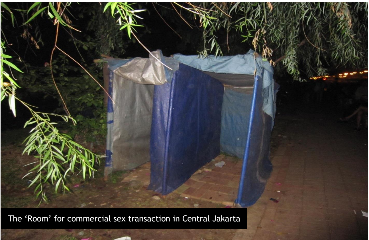
The 'Room' for commercial sex transaction in Central Jakarta

The TPB variables were differentially related to the five behaviours. Attitude was associated with three behaviours, PBC with three behaviours and subjective norms with two behaviours. The explained variance in behaviour ranged between 21 and 42% (Table 1). A review of 26 studies showed that the overall average explained variance in behaviour was 34%, varying from 15.6% (clinical and screening behaviours) to 42.3% (HIV-related behaviours) (Godin & Kok, 1996). Thus, the explained variances of behaviour in this study span within the range of explained variances in earlier studies.