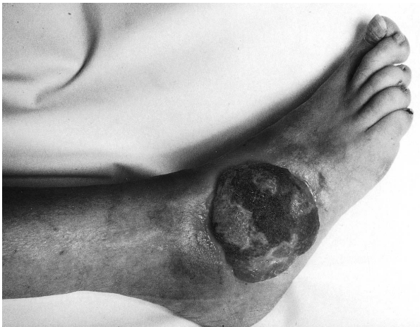
Fig. 2 Clinical appearance of the patients right foot demonstrating the second recurrence

Because of the patients persistent refusal to undergo an amputation, a HILP with TNF, IFN and melphalan was suggested and informed consent was obtained. One and 2 days before HILP, a dose of 0,2 mg of IFN (Boehringer Ingelheim, Ingelheim, Germany) was administered subcutaneously. A 90-minute mild hyperthermic (39°C to 40°C), popliteal perfusion was performed with 0,2 mg of IFN, 4 mg of TNF