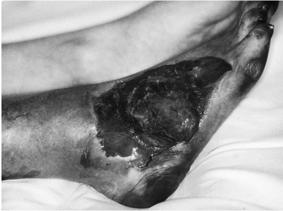
Fig. 3 The right foot and ankle region 2 days after hyperthermic isolated limb perfusion with TNF, IFN and melphalan. The tumor is black necrotic and the rest of the foot is blue, sharply delineated at the edge of the radiation field.

(Boehringer Ingelheim), and 45 mg of melphalan (10 mg/L of limb volume)(Burroughs Wellcome, London, England). Leakage to the systemic circulation measured with ^{131}\text{I} labeled albumin as a tracer was 2.8 %. 3 ECG, urine output, blood pressure, venous and pulmonary pressures were recorded during and after perfusion until the second postoperative day. A continuous infusion of dopamine at 2.8 mg/kg/min for 18 hours was given. Postoperatively the patient experienced fever and chills but no hematological, hepatic or renal toxicity was observed.