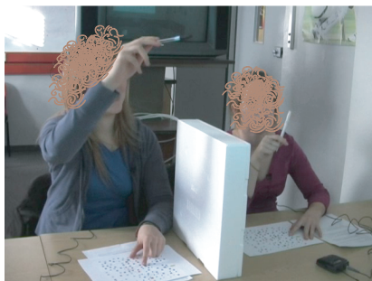
Figure 3. Two participants at work in the pilot of the experiment.