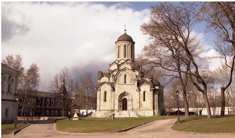
Figure 1 The Saviour Cathedral of the St. Andronicus Monastery in Moscow