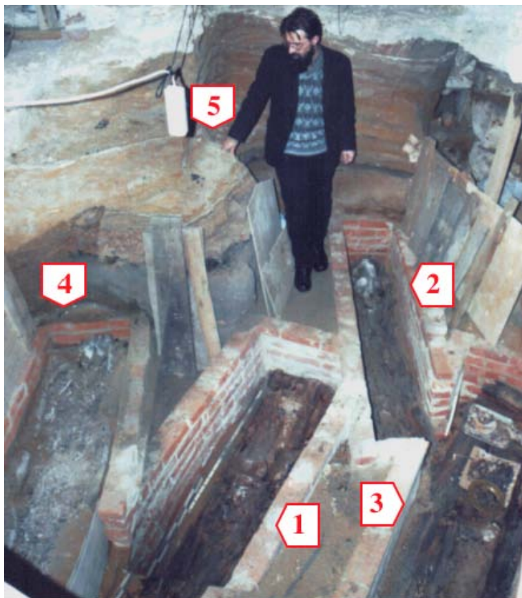
Figure 2 Tombs (numbered 1–5) excavated in the Saviour Cathedral, St. Andronicus Monastery.

2005). The wide range of analyzed elements is a distinctive feature of the method. Diet reconstructions are based on the study of a relatively small (usually 4) number of elements (Gilbert 1977; Kozlovskaya 1996). We have used a TEFA-III (ORTEC) energy-dispersive XRF machine.