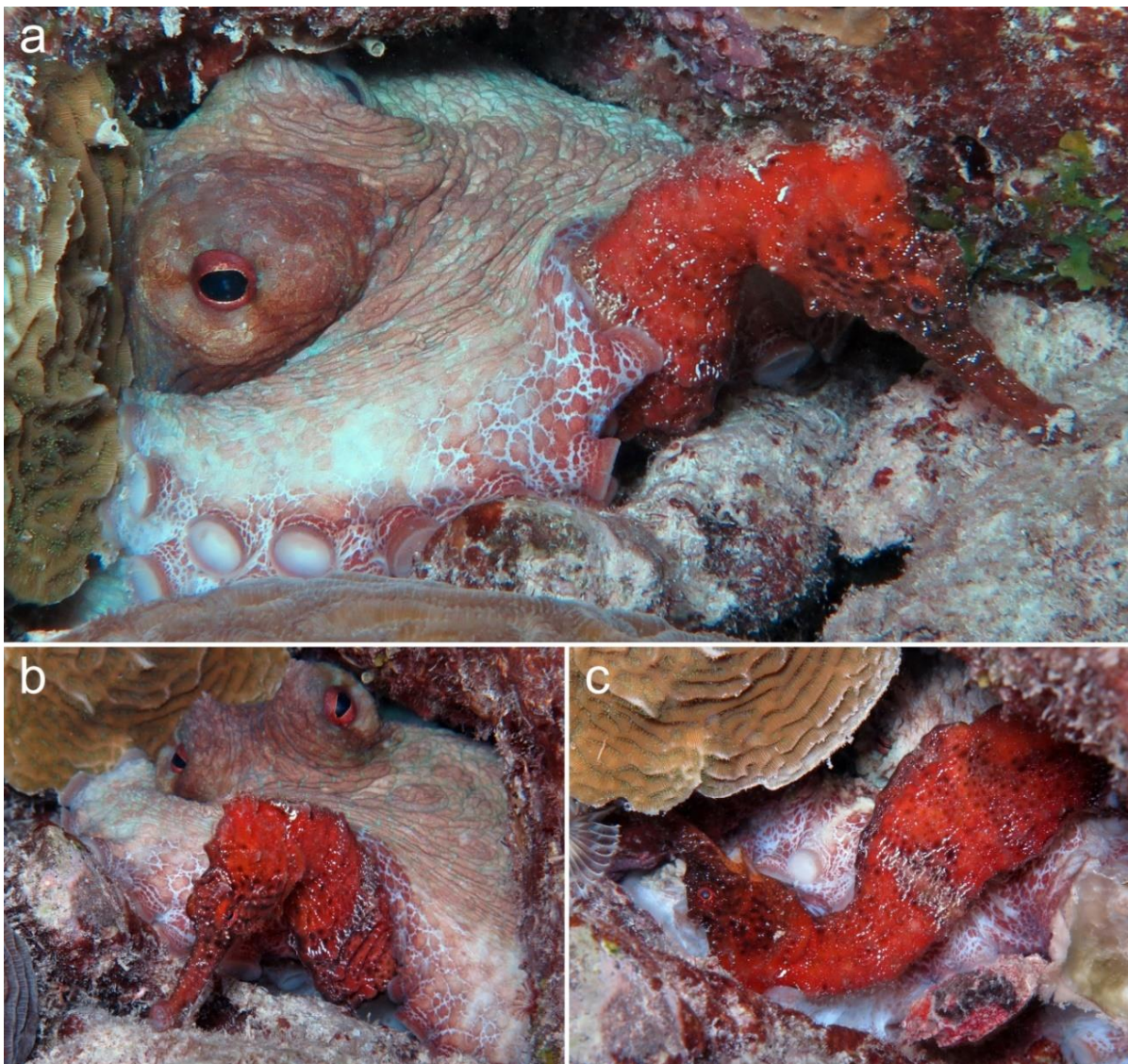
Figure 1. A red longsnout seahorse ( Hippocampus reidi ) killed by a common octopus ( Octopus vulgaris ) at Bonaire, Southern Caribbean. The octopus is partly hiding underneath a sunray lettuce coral, Helioseris cucullata . (a,b) The seahorse in the grip of the octopus. (c) The seahorse is stunned or dead.

This observation was made during a recreational late-afternoon dive at the airport fuel pier of Bonaire (12°08'03" N 68°16'53" W), when visibility was poor due to wave action. The seahorse, which had been observed at 7–8 m depth over a period of many months, was spotted at the start of the dive but was no longer visible at the end of the dive, less than an hour later. It was found back at 4 m depth in the tight grasp of the octopus, which resided underneath a sea lettuce coral, Helioseris cucullata . The seahorse could not free itself from the grip of its predator (Figure 1a,b) and appeared to be stunned or dead (Figure 1c). It was never seen again during consecutive dives. Hippocampus reidi is a common and widespread species in the West Atlantic and Caribbean Sea, which is considered to be Near-Threatened (NT) by the IUCN Red List [4].