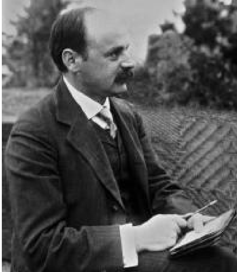
Fig. 4 Karl Schwarzschild in one of the few pictures available of him.

takes more than twice the exposure time to reach the same level of photographic density for twice as faint incident light). He derived an empirical formula describing the relation between exposure (brightness multiplied by exposure time) and the resulting photographic density. Already in 1901, after a second period in München, he was appointed professor and director of the Sternwarte in Göttingen. His most important work at that time was the Göttingen Actometrie 2 , a survey of stellar magnitudes between the celestial equator and +20^\circ declination, replacing his method of out-of-focus exposures by a new method based on a regular shaking of the plate during exposure to distribute the light over a larger area of emulsion. The instrument developed for this was called a Schraffierkassette .