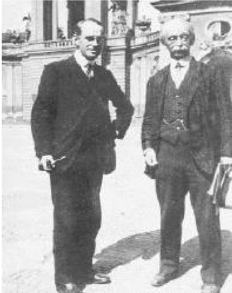
Fig. 10 Arthur Eddington and Jacobus Kapteyn. It is not known when, where and by whom this photograph has been taken. Oort was presented with a copy of this by S. Chandrasekhar. For the full story see [24]. It would seem that this photograph has been taken around 1920.