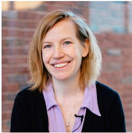
Amy Wagers Harvard University

The surprising observation, made 30 years ago in C. elegans , that inactivation of even a single gene can be sufficient to slow the aging process and significantly extend lifespan marked a revolution in aging research because it demonstrated that aging can and should be viewed as a biochemically controlled process suitable for molecular dissection, rather than a simple process of “wear and tear.” A similar revolution has occurred more recently, with the growing appreciation that not only can the effects of aging be slowed—they may be reversed. Indeed, studies in mice have now demonstrated that certain interventions, including telomerase reactivation, senescent cell ablation, alteration of neuroendocrine signaling, and exposure to age-variant systemic factors can restore “youthful” function in many, distinct aged tissues. The cellular and molecular mediators of these effects are beginning to be uncovered, and they are thus far consistent with the existence of common networks regulating age-associated decline and “rejuvenation” across organ systems. These findings present exciting possibilities for regenerative medicine and also raise the fascinating question: what is rejuvenation in molecular terms? How is cellular function remodeled by these interventions, and do rejuvenated cells truly return to a durable youthful state? Answering this question will resolve essential issues in aging physiology and enable new treatments that can improve human health throughout the lifespan.