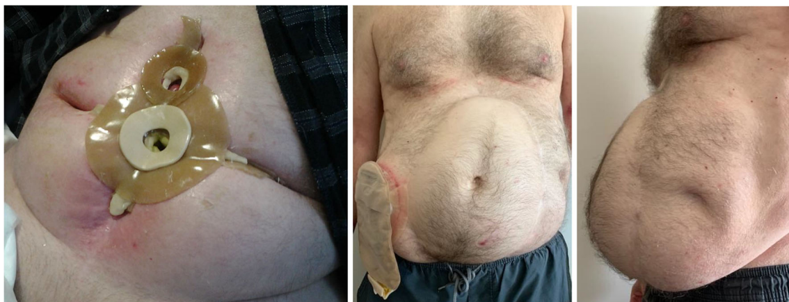
Fig. 1 A 66-year-old male. Clinical photographs taken 6 6 years and 9 months after combined AW-VCA and ITx due to Crohn’s Disease. Left - pre-transplant state: TPN dependent, multiple preceding laparotomies,

Oxford have performed one isolated AW-VCA for reconstruction of a massive hernia in a patient with an existing functional kidney transplant. As the patient was already immunosuppressed, the ethical debate about non-life saving transplantation was avoided, though there was debate regarding risk to the kidney transplant. Two units from the USA have now performed penis VCAs that included varying amounts of abdominal wall within the transplant [27•, 28]. This new combined VCA, without associated visceral organ transplantation, offers hope for many war veterans who have sustained composite genitourinary and abdominal wall injuries.