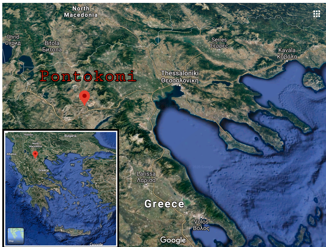
Fig. 1. Map of Macedonia showing the location of Pontokomi.

the Late Hellenistic times and for the two cemeteries the Late Archaic – Classical and the Roman period, respectively (Karamitrou-Mentessidi, 2001, 2002, 2009).