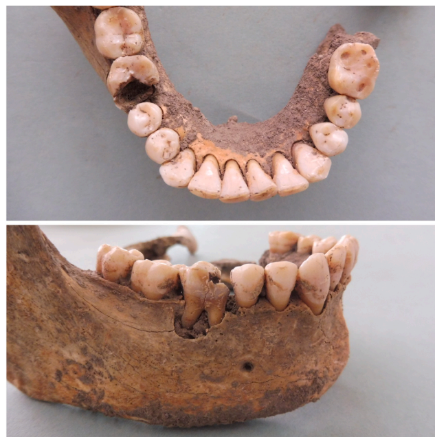
Fig. 3. Female young adult right mandibular first molar showing gross caries and periapical cavity; Tomb 114 of the Pontokomi skeletal assemblage, Kozani, Greece, 1st to 4th c. CE (photo by Vergidou C. with the kind permission of Dr. Karamitrou-Mentessidi).

Analysis by jaw and tooth type showed moderate occlusal wear for all teeth in the sample, which increased slightly with age (incisors, canines, premolars: 3.65–5.08; molars: 13.00–25.92, Tables 7 and 8). Bilateral asymmetry was examined using paired Wilcoxon signed-rank test to identify any differential use of the mouth in masticatory activities. Statistically significant differences were found in the maxillary second molars and the mandibular canines ( M^2 Z = -1.941 , p = 0.052 ; C_1 Z = -2.066 , p = 0.039 ). When sex, jaw, tooth type and tooth side were considered (Table S1), males showed clearly higher rates of wear than females with statistically significant results in the maxillary left second incisors and canines ( I^2 U = 71.000 , p = 0.053 ; C^1 U = 96.000 , p = 0.011 ), the right first and second molars ( M^1 U = 80.000 , p = 0.053 ; M^2 U = 53.000 , p = 0.013 ) and the mandibular right first molars and left