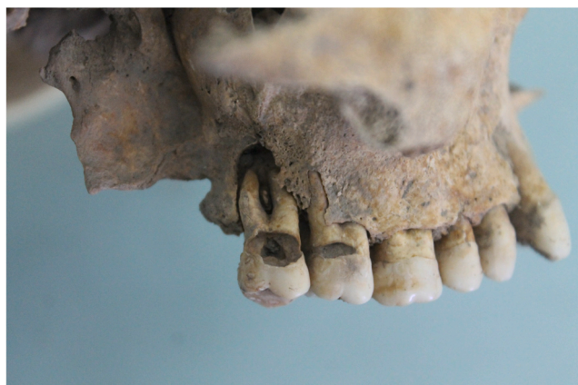
Fig. 2. Male young adult maxillary right second and third molars showing caries and periapical cavities; Tomb 40 of the Pontokomi skeletal assemblage, Kozani, Greece, 1st to 4th c. CE (photo by Vergidou C. with the kind permission of Dr. Karamitrou-Mentessidi).

(OA) groups the difference between sexes was statistically significant (MA: m. 9.2%; f. 25%; \chi^2 = 14.02 , p < 0.001 ; OA: m. 9.7%; f. 24.2%; \chi^2 = 7.797 , p = 0.005 ). However, when the DMI was applied, frequencies for both sexes were almost the same (m. 20.7%; f. 21.5%, Table 6). Finally, no statistically significant difference was found between the two jaws, which were almost equally affected by caries (Tables 4 and 5).