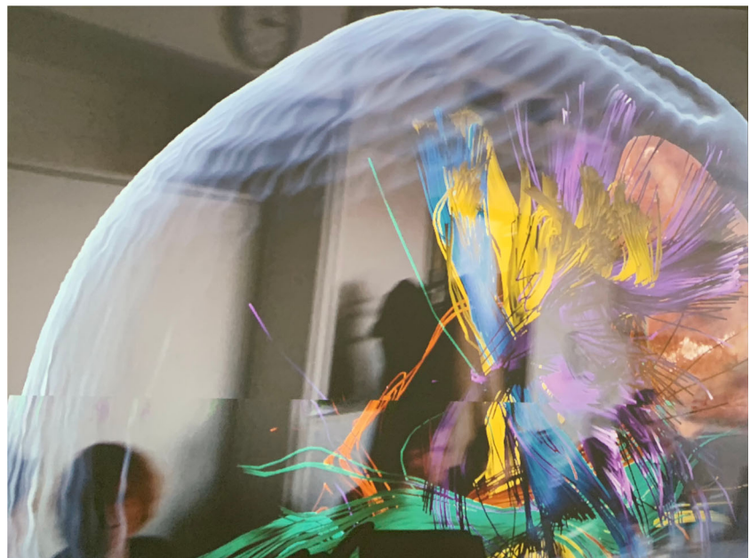
Fig. 3 The figure shows another screenshot visualizing the participants view during the application of AR for fiber dissection. The different colors show different tracts. The tractography model is projected in the room

purposes (Table 2). Moreover, proven by the composition of the participants, various disciplines frequently use this technique for the visualization of white matter pathways, and 92.3% of participants evaluated the presented cases as reflecting their clinical reality. Hence, the present results of the evaluation of AR for fiber dissection as a new