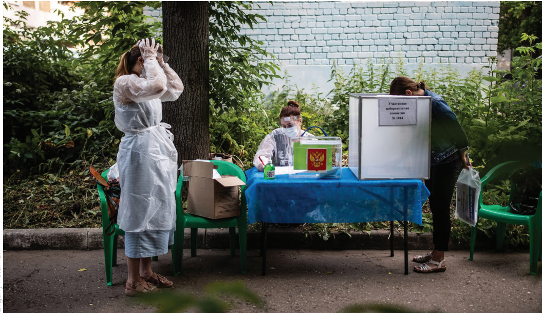
Left: One of many makeshift polling stations set up throughout Russia to allow people to vote in the July 2020 plebiscite, which took place during the Covid-19 pandemic.