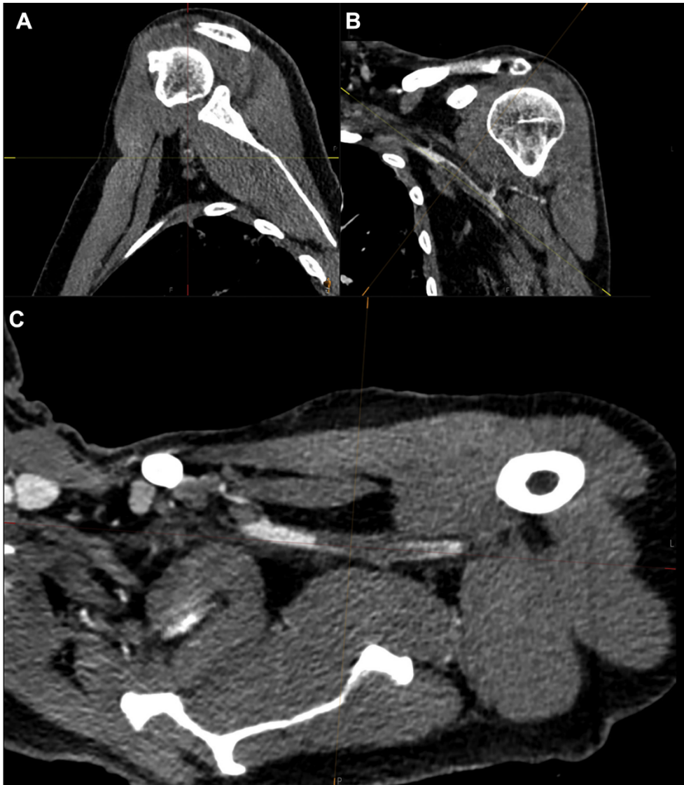
Fig 2. A 55-year-old COVID-19-positive man with a medical history of diabetes with oral metformin use presented with a pale, pulseless left hand without muscle weakness and minimal sensory loss of the fingers. Acquired computed tomography angiography (CTA) imaging showed subclavian artery occlusion. A, Sagittal view. B, Coronal view. C, Axial view.

a total of 738 patients, and eight case report studies have reported the occurrence of arterial thrombotic events (Table II). In a series of 150 ICU patients referred to four French ICUs reported by Helms et al, 2 four arterial occlusions were observed, of which one caused mesenteric ischemia, one limb ischemia, and two cerebral ischemia. von Willebrand factor activity, von Willebrand factor antigen, and factor VIII were considerably increased in all patients, and 50 of 57 tested patients (87.7%) had positive lupus anticoagulant.