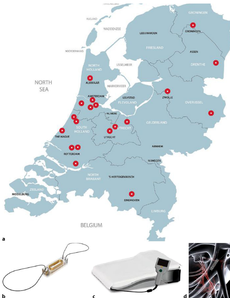
Fig. 2 a Overview of Dutch sites participating in MONITOR-HF; b The CardioMEMS sensor (with permission of Abbott Inc.); c The CardioMEMS HF system patient unit including antenna (with permission of Abbott Inc.); d Location of the CardioMEMS sensor in the left pulmonary artery (with permission of Abbott Inc)

in addition to contemporary standard HF care in the Netherlands. This clinical trial, which is supported by healthcare authorities and Abbott, was launched in 2019 and is currently ongoing in 20 Dutch hospitals (Clinical Trial registration number NTR7672) and will help to evaluate whether home monitoring of pulmonary artery pressures will improve HF outcomes for a societal and healthcare perspective (Fig. 2; [59]).