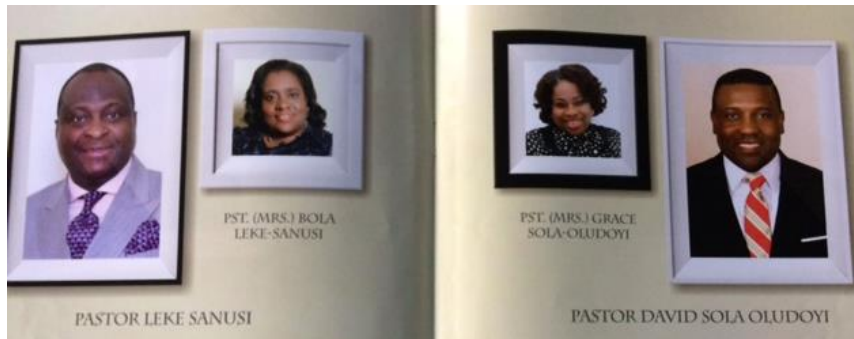
Figure 2: Primary Material, RCCG, EUROCON 2017

While research on female leadership in Pentecostal settings is still limited—and academic research has its own gender biases—there are studies that suggest that in practice female leaders often have their own space for leadership (Soothill 2007, Mayer 2016). In fact, female leaders may even become quite influential because they are more trusted and acknowledged with intimate and emotional matters by the people in their congregations (Cassleberry 2018). Some studies suggest, that women from Pentecostal churches feel spiritually empowered and negotiate better positions, not only in their families and churches but also in their secular careers.