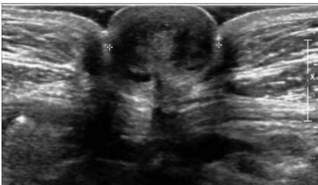
Figure 2: Ultrasonography of the umbilicus demonstrated a hypodense nodule of 1.8 cm in the umbilicus.