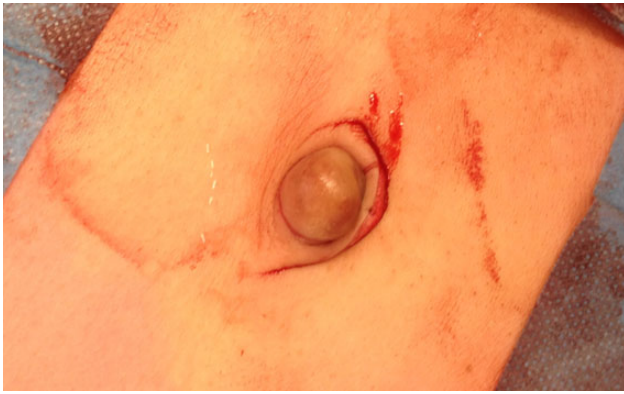
Figure 1: Clinical presentation of a livid, soft, painful swelling in the umbilicus, which could not be reduced by gentle digital pressure.