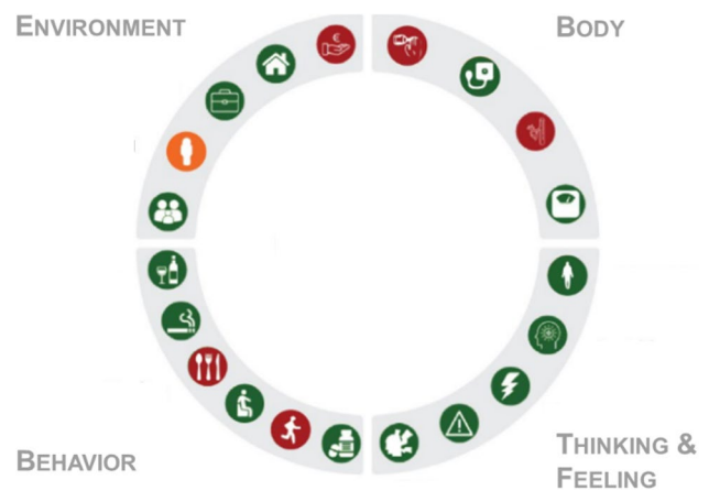
Fig. 1 Visualization of the “profile wheel” resulting from an extensive 360° diagnosis. The profile wheel is constructed of four quadrants: environment, body, behavior and thinking and feeling. The quadrants are further split up in sub-domains, including glucose metabolism, body composition (body), medication use (behavior) and loneliness (environment). The colors represent the traffic light model, with green representing a healthy score for a sub-domain, orange an in-between state and red an unhealthy score

Previously in 2011, Huber et al. proposed to shift the focus in defining health from absence of disease towards “the ability to adapt and self-manage in the face of social, physical and emotional challenges” [20]. This definition advocates for more attention for the individual and their environment, instead of only focusing on standard clinical parameters. In other words, health should be approached as a system, taking into account the complex interplay between genetics, metabolic processes, lifestyle, psychological health and the socio-economic environment [64]. Using such a systems approach is not only of importance in health research, but also in health care practice. Research has shown that factors like motivation, comorbidities, mental health (e.g., depression), personality traits (e.g., self-efficacy) and the financial situation can negatively influence health behavior change and self-management [3, 46]. Such factors should thus be taken into account in developing an individual treatment plan. A so-called 360° diagnosis, ranging from personality questionnaires to sensors to sample analysis, can facilitate an extensive evaluation of the physical and mental health status of a patient, as well as their behavior and environment. The results can be visualized in a ‘profile wheel’, and as such offer a snapshot overview of a patient and their most pressing issues, and serve as a shared decision-making tool between patient and health care provider [64] (see Fig. 1).