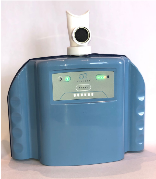
FIGURE 1 Electronic nose used in the study; the Aeonose (The eNose Company). Patients inhale through a carbon filter to prevent the entry of nonfiltered environmental air and breathe into the device through a disposable mouthpiece while wearing a nose clip

different material properties. VOCs present in exhaled breath cause redox-reactions at the sensor surfaces of the e-nose which results in conductivity changes that are measured and analysed. VOCs interact competitively with these sensors, depending on the physical and chemical characteristics of the sensor material. As the reaction kinetics are temperature-dependent, the metal-oxide sensors of the device are guided through a sinusoidal temperature profile to optimise the amount of information gathered from exhaled breath. Basically, in this way a virtual sensor array is built mimicking identical sensors at different temperatures. 37 During each cycle, conductivity is measured 32 times. In the end, all conductivity values are combined to represent the composition of the total VOC mixture, called a "breathprint", and each breathprint consists of approximately 7000 conductivity values.