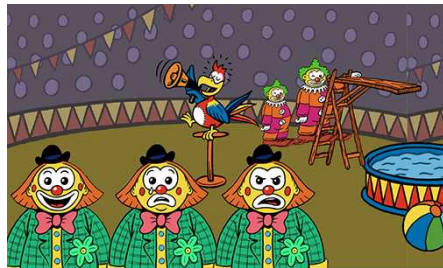
Figure 1. The experimental interface of the EmoHI test.

The experiment was conducted on a laptop with a touchscreen using a child-friendly interface that was developed in Matlab (Figure 1). The auditory stimuli were presented via Sennheiser HD 380 Pro headphones and calibrated to a sound level of 65 dBA. In each trial, participants heard a stimulus and then had to indicate which emotion was conveyed by clicking on one of three corresponding clowns on the screen. Visual feedback on the accuracy of responses was provided to motivate participants. Participants saw confetti falling down the screen after a correct response, and the parrot shaking its head after an incorrect response. After every two trials, one of the clowns in the back went one step up the ladder until the experiment was finished to keep children engaged and to give an indication of the progress of the experiment.