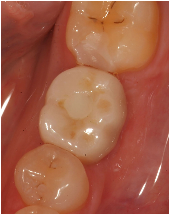
FIGURE 1 Full-contour zirconia screw-retained restoration at position 36

was performed under local anesthesia. A parallel-walled implant with a TiUnite surface and conical connection (NobelParallel CC, Nobel Biocare AB, Goteborg, Sweden) was placed, according to the manufacturers' protocol. Implant diameter was 4.3 mm and length varied from 8.5 to 13 mm, dependent on available bone height at the implant site. A cover screw (Nobel Biocare AB) was placed, and the wound was closed. One week after implant placement, a follow-up visit was scheduled for suture removal and review of the healing process. After 3 months, the implant was uncovered and a healing abutment (Healing Abutment CC RP, Nobel Biocare AB) was installed.