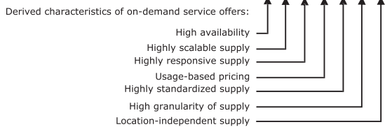
Table I. Overview of literature

literature. Further, on-demand services are often linked to access-based services (Lawson et al. , 2016; Schaefers et al. , 2016) and the sharing economy (Fehrer et al. , 2018; Kumar et al. , 2018). In some cases, there is indeed a clear link between these concepts, but also an important difference: sharing resources and offering access to goods does not automatically mean these are supplied instantaneously on demand. On-demand provisioning is also often related to multi-sided platforms (Andreassen et al. , 2018; Hagiu and Wright, 2015; Parker et al. , 2016). Such platforms are frequently used by service providers to collect available resources for on-demand supply. At present, these platforms are frequently studied, focusing on topics such as pricing and capacity management (Bai et al. , 2018; Taylor, 2018). However, again, it is important to note that multi-sided platforms are not necessarily on-demand.