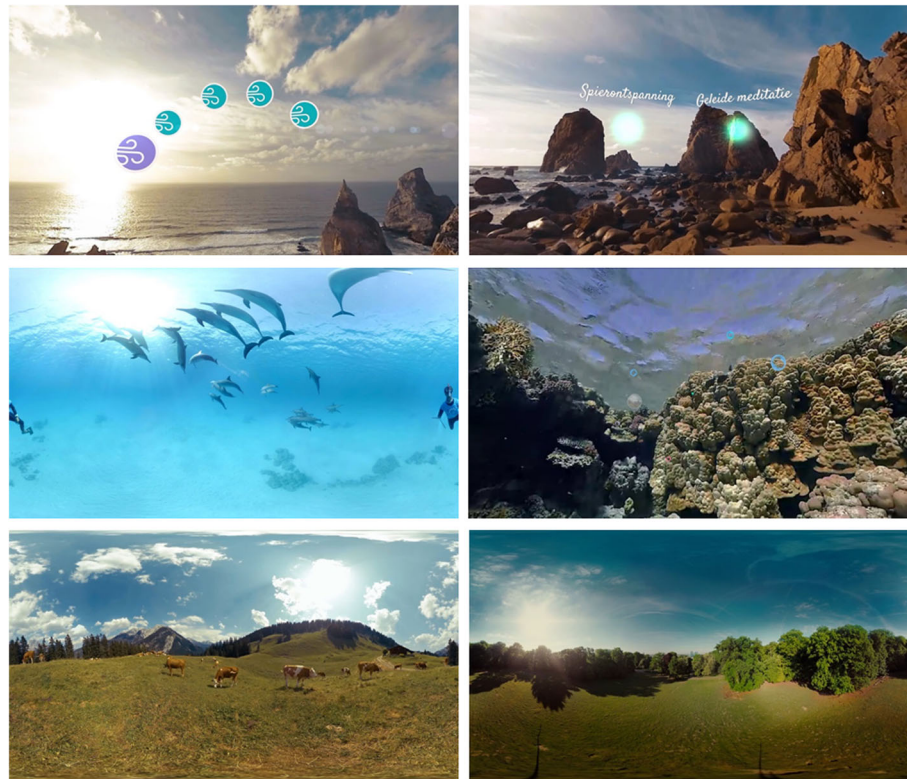
Fig. 3 VRRelax environments, including relaxation exercises. The virtual environments are property of Viemr BV; images have been used with permission from Viemr BV

disturbing and aggressive behavior (e.g., problems with law enforcement). The ratings for each domain are combined into one score from 0 (very low) to 100 (very high), which will be used for analysis.