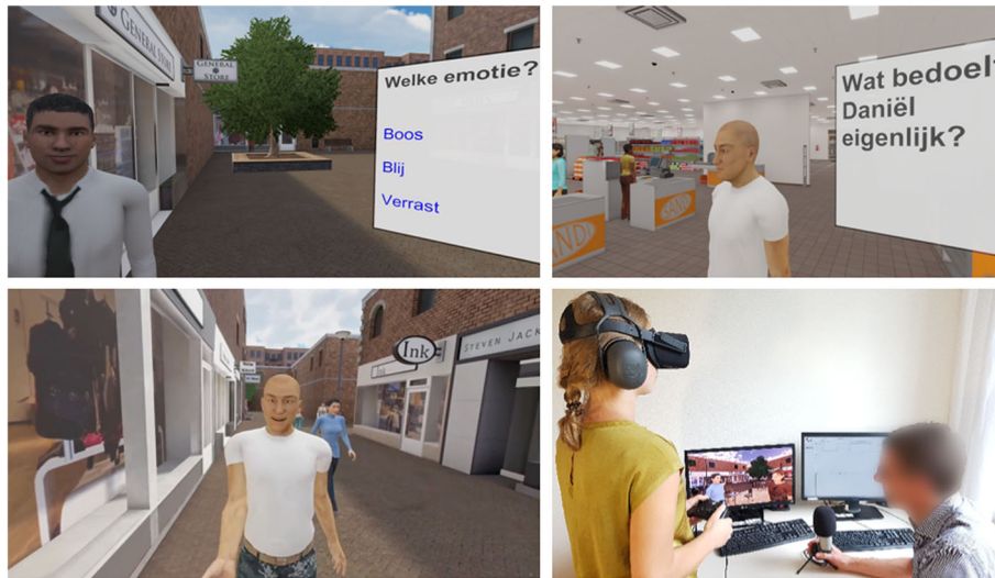
Fig. 2 Pictures of DiSCoVR environments and set-up. Legend: Top left: module 1 (translation: which emotion? Angry, happy, surprised); top right: module 2 (translation: what does Daniël actually mean?); bottom left: module 3, as seen from perspective of participant; bottom right: module 3, interactive role play setup.

eight weeks (the same as DiSCoVR), and aims to reduce both momentary (during sessions) and daily life stress and anxiety. VRelax is provided by therapists who either have 1) clinical experience in treating people with psychosis (e.g., psychiatric nurses); or 2) at least a bachelor's degree in psychology. In VRelax, participants' stressors are explored (i.e., which situations are stressful, and what are signs of stress). Participants learn to recognize stressful thoughts and rumination, and to apply coping strategies to address these (e.g., solving problems, asking for support and comfort, finding distraction). They also practice with relaxation exercises, such as breathing exercises, a body scan, grounding, and progressive muscle relaxation. Participants are encouraged to practice these techniques at home.