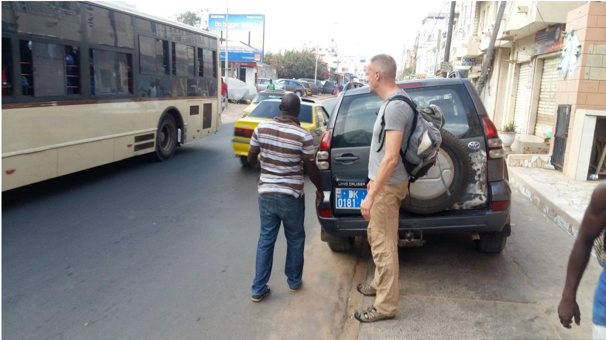
Arrival in Dakar