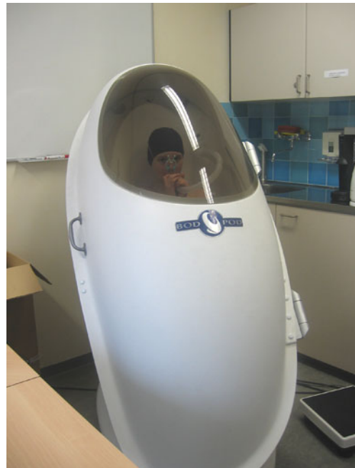
Fig. 1 A child within the BodPod whole body air-displacement plethysmograph

Body composition in patients with PKU was measured using the BodPod whole body air-displacement plethysmography method (Life Measurement Incorporation©; Fig. 1). After system warming-up, calibration and manual entering of gender, age and body height of the children, body weight was the first parameter to be determined by stepping on the BodPod weighing scale (Life Measurement Incorporation© 2004). Second, patients were seated within the BodPod chamber wearing tight underwear and a bathing cap, to minimize extracorporeal air volumes which could eventually bias the measurements (Life Measurement Incorporation© 2004). Next, body volume was measured indirectly by determining the pressure change caused by the volume of air displacement of the subject sitting inside the tightly closed chamber. The thoracic gas volume was determined by letting the child breathe through a tube connected within the BodPod, to correct for the air volume contained within the lungs during the measurement procedure (Life Measurement Incorporation© 2004). From body