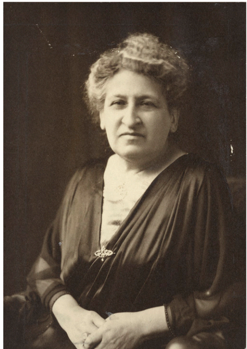
Aletta Jacobs. Photograph by Julius Oppenheim, The Hague, Netherlands, 1924. Courtesy of the Library of Congress.

Recently, Icelandic historian Erla Hulda Halldórsdóttir argued in the Women's Historical Review that even a life wholly lived in the countryside of Iceland in the nineteenth century could be considered an international life due to the constant flux of information and goods going in and out of Iceland. 2 That clearly relativizes the exceptionality of Jacobs as an international feminist. 3 Indeed, what do we mean by nation and internationalism in an era when many images of the nation — including the idea of nation itself — were invented? 4