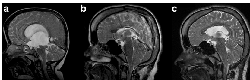
Fig. 2 MRI scans of a 3-year-old girl with hydrocephalus due to aqueductal stenosis (a). She was treated with a third ventriculostomy and a ventriculoperitoneal shunt. Several years later, she developed an acquired Chiari I malformation with cranial vault thickening (b). After

augmentation of the posterior fossa by thinning the occipital planum and decompression of C0 and a C1 laminectomy with dural patch grafting, the postoperative MRI scan shows an adequate decompression (c)