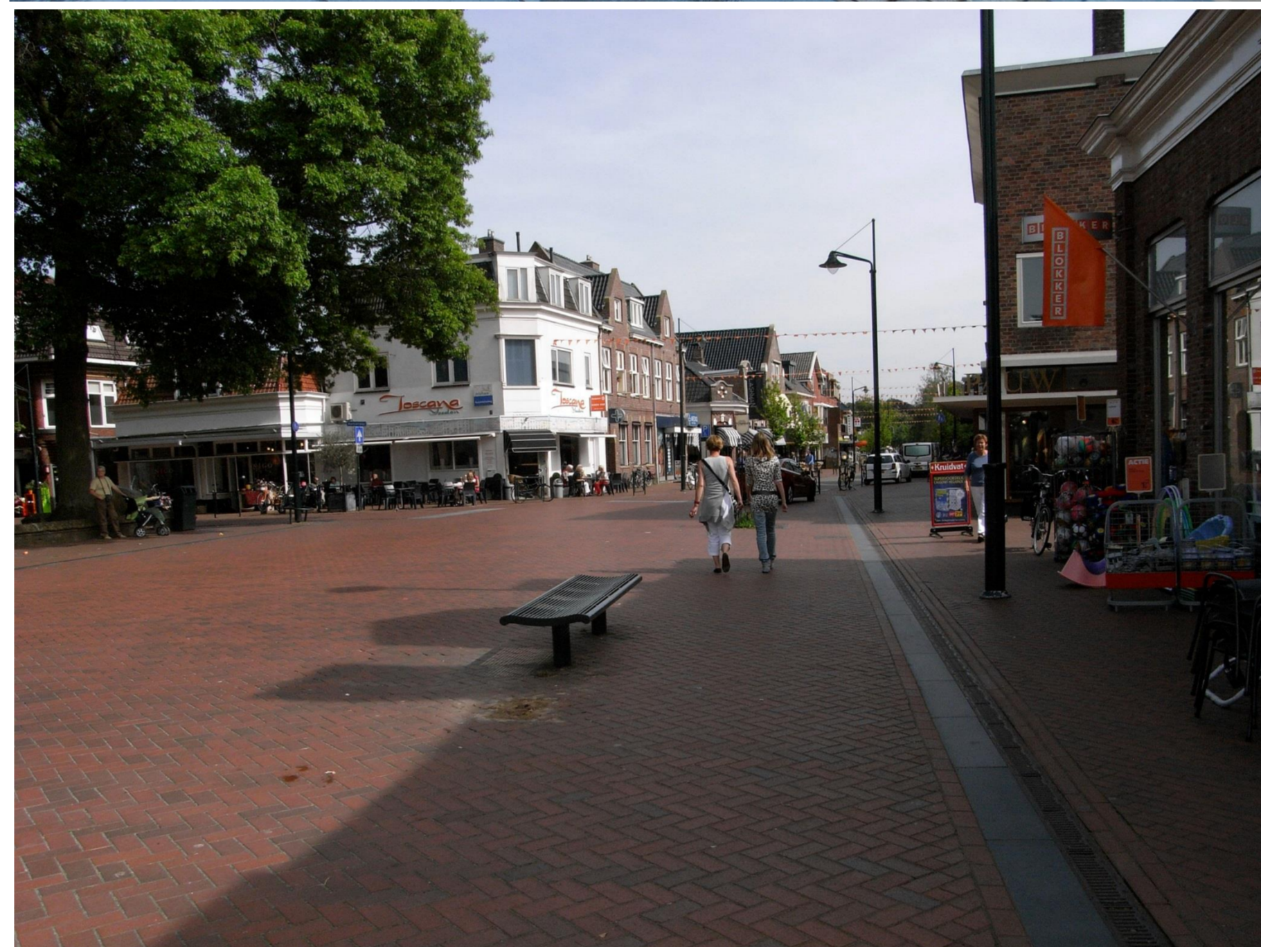
Figure 3: shared-space area, Rijksstraatweg in the centre of Haren, NL