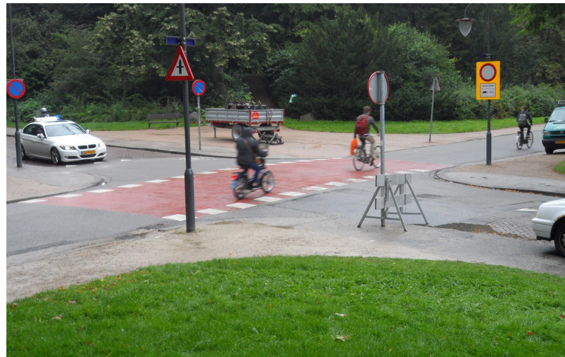
Figure 1: intersection with priority regulation (Kerklaan x Leliesingel in the Noorderplantsoen in Groningen, NL)

Results: Figure 4 shows the results, which were concentrated on the effects of location. The original BSc-theses upon which these results are based, are available on request.