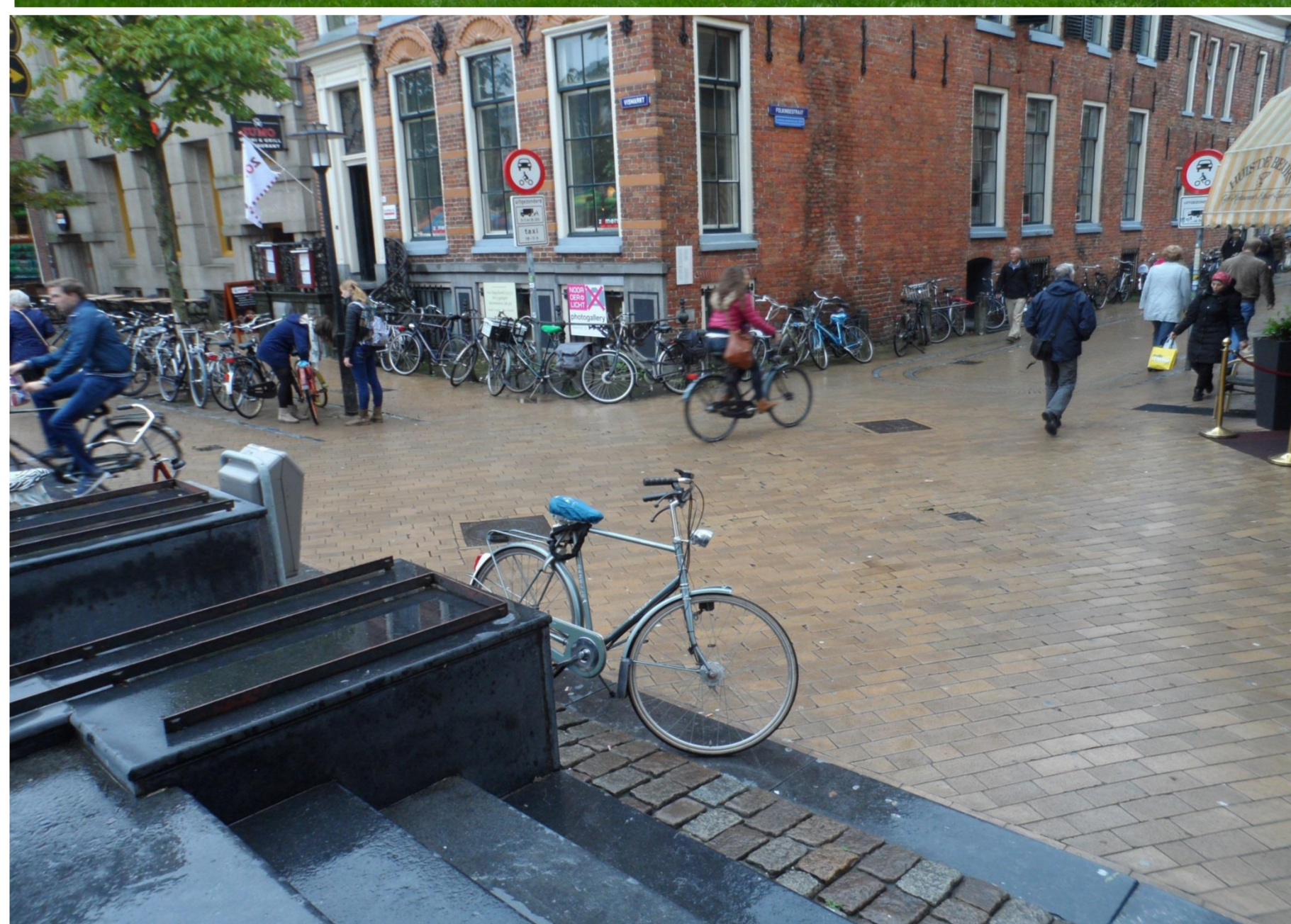
Figure 2: intersection without priority regulation (Folkingestraat x Vismarkt in Groningen, NL)