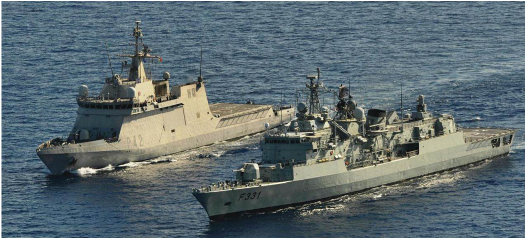
The EU's counterpiracy mission 'Operation Atalanta' off the coast of Somalia has been active since 2008.

maritime activity extends even further west than the Indian Ocean. In 2011, a Chinese warship was present in the Mediterranean Sea to assist in the evacuation of Chinese citizens from Libya during its civil war. A Chinese state-owned company, Cosco, is currently engaged in container port management in Greece (Van der Putten, 2014), and in the eastern Mediterranean the Chinese navy is escorting ships engaged in the chemical disarmament of Syria, operating from Cyprus.