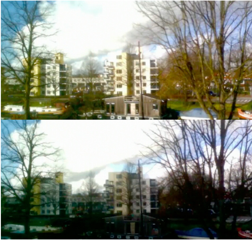
Figure 2. Environmental variability.

In many parts of the world, environmental light can change, practically from one minute to the next, due to cloud cover. The scene here shows pictures taken within several minutes on a day in March 2009 in the Netherlands, illustrating the noisy light environment.