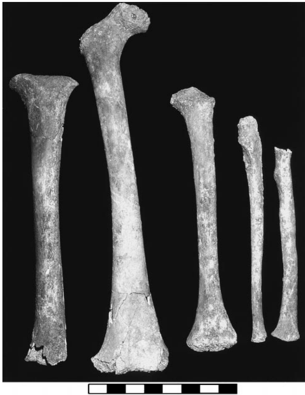
FIG. 4. Anterior view of the long bones. (Black and white bars = 1 cm each.)

seal length provides a tight linear fit between the variables for the age range ( \approx 2\text{--}8 years) in a cool-temperate modern human sample ( r^2 = 0.983 ), with Skhul 1 falling above the line and both La Ferrassie 6 and Lagar Velho 1 falling significantly below the recent humans (Table 2). Given the hyperarctic versus tropical proportions of Neandertal versus Qafzeh-Skhul adult remains (38), the separation of the La Ferrassie and Skhul specimens is expected. However, the low position of Lagar Velho 1 is unexpected, given the relatively long tibiae of all known European earlier Upper Paleolithic humans (32).