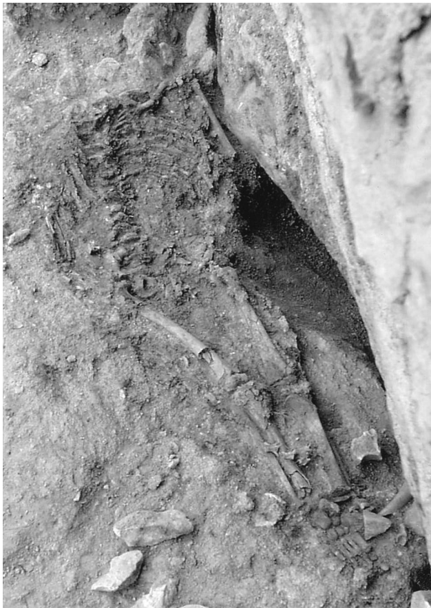
FIG. 1. Lagar Velho 1 in situ , with damaged skull and left forearm elements already removed.

The only diagnostic archeological item in the burial was a pierced Littorina obtusata shell found near the cervical vertebrae; it is identical to those from Level Jb of the nearby site of Gruta do Caldeirão (Tomar) dated to 26,020 \pm 320 years B.P. (OxA-5542; ref. 6). Similar burials with pierced shells and/or teeth and a covering of ochre are known particularly from the Gravettian of Europe, especially from Britain (Paviland), Italy (Arene Candide, Barma Grande, Caviglione, Ostuni), and the Czech Republic (Brno, Dolní Věstonice; refs. 10–12).