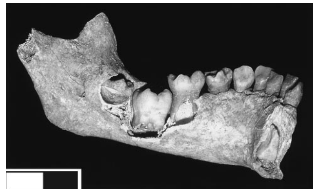
FIG. 2. Lingual view of the mandible and dentition, showing the degrees of dental development, the symphyseal retreat, and the prominent right tuberculum laterale. (Black bar and white bar = 1 cm each.)

Materials and Methods. This preliminary assessment of Lagar Velho 1 is concerned with its morphological affinities to northwestern Old World late archaic humans (Neandertals) versus early modern humans. The latter sample consists predominantly of Aurignacian and Gravettian remains between 20,000 and 30,000 years B.P. Given the dearth of earlier Upper Paleolithic juvenile human remains, the comparisons also involve Near Eastern Middle Paleolithic (Qafzeh-Skhul) early modern humans. Recent human comparative data are included as appropriate, the samples deriving from temperate European and North American samples (17–19). The relative positions of the fossil specimens in the postcranial proportional assessments are based on distributions of raw residuals from the reduced major axis lines for the recent human samples and are expressed as z scores.