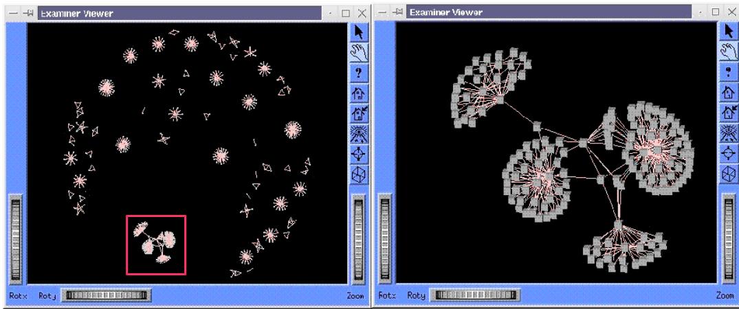
Figure 2: Visualization of 600 artifacts in mobile phone software

erface a layout algorithm needs to provide to be integrated in our toolkit is minimal. Integrating layout tools such as GEM [1] and GraphViz [2] has taken under 50 lines of code in our toolkit.