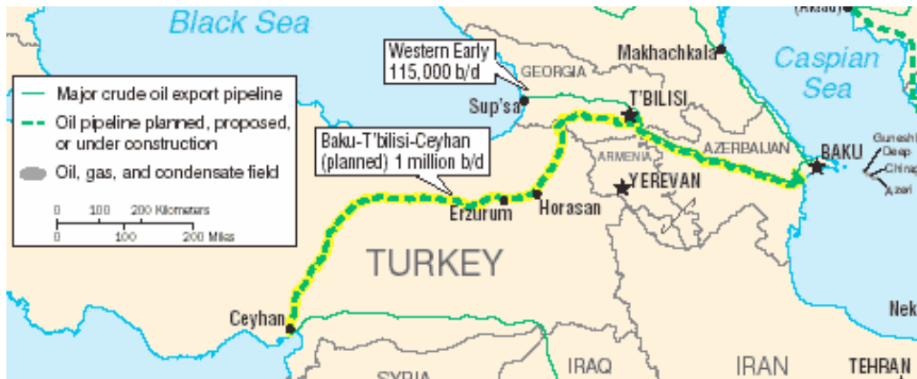
Figure 1: BTC Pipeline