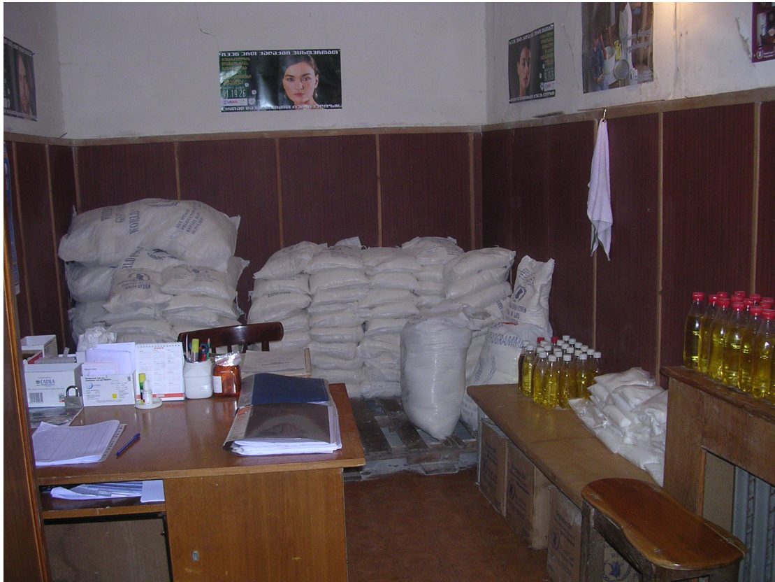
Photo 9: WFP project concerning food for TB patients at a TB dispensary in Tbilisi