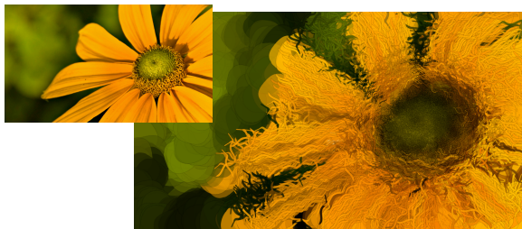
Figure 5: Using a background image (top) a stroke-based rendered image was created in less than 5 minutes (bottom).

Fig. 5 shows an example in which the technique was applied to create an NPR version of a photograph. Notice how the different regions of the picture are expressed using a number of unique, self-created stroke primitives. While this technique may be useful for artists, we see its main user group in the general public: People will be able to experiment with their personal photographs as touch-sensitive displays are becoming increasingly common. The use of easy and intuitive hand postures will allow users to employ a range of styles without having to resort to looking up menu options.