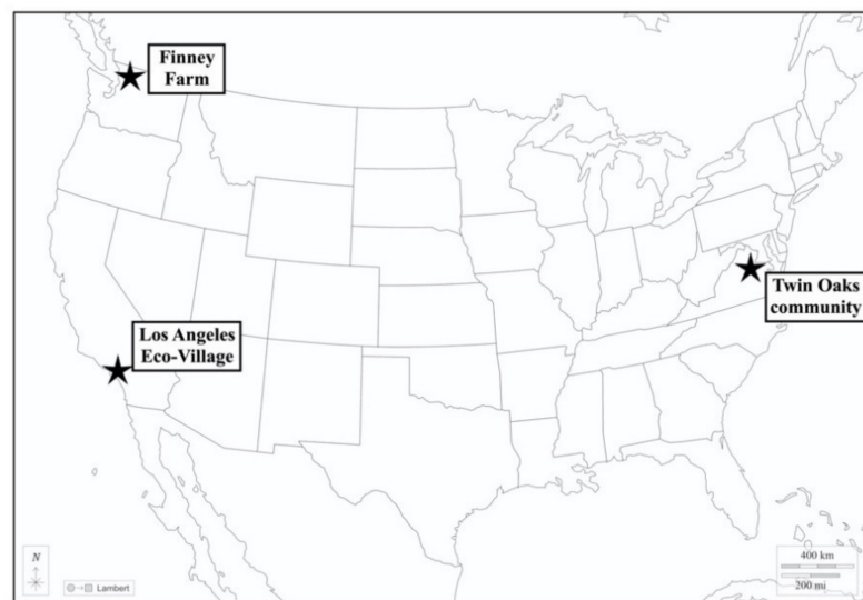
Figure 2. The three ecovillages studied with their locations in the United States.

This study researches collective identity and sustainability transformations at three ecovillages in the United States—Twin Oaks in rural Virginia; LAEV in Los Angeles, California; and Finney Farm, in rural Washington state. In order to reflect the diverse American landscape, this research includes communities located in the rural and (overall) conservative South, urban (progressive) Southern California, and rural (environmentalist) Pacific Northwest (see map, Figure 2).