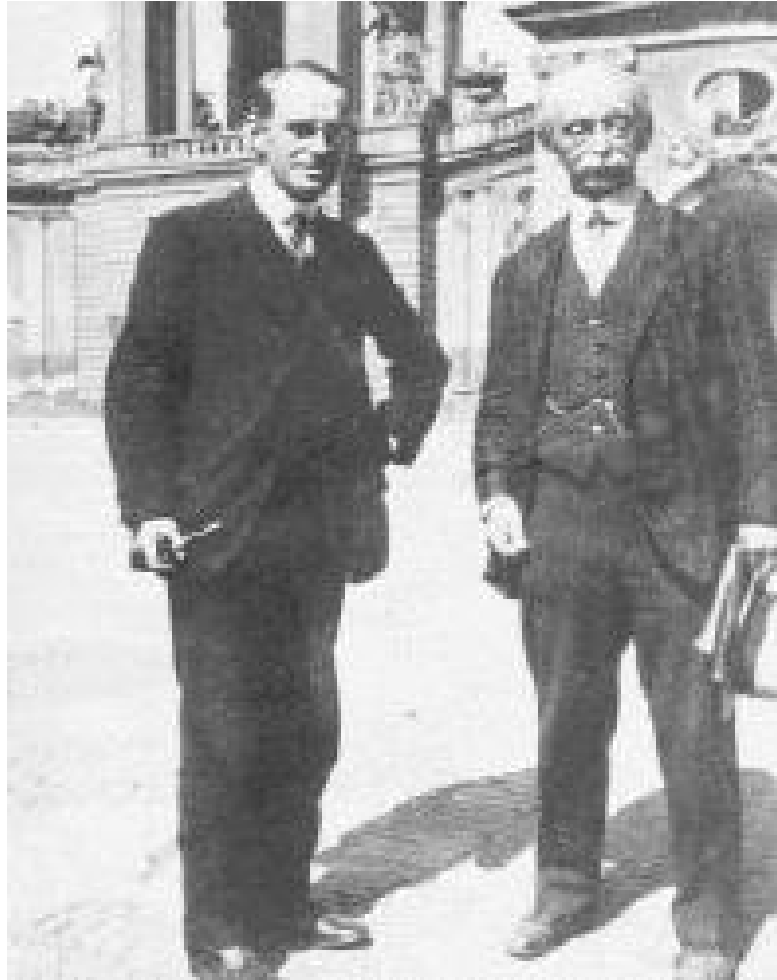
Fig. 10 Arthur Eddington and Jacobus Kapteyn. It is not known when, where and by whom this photograph has been taken. Oort was presented with a copy of this by S. Chandrasekhar. For the full story see [24]. It would seem that this photograph has been taken around 1920.