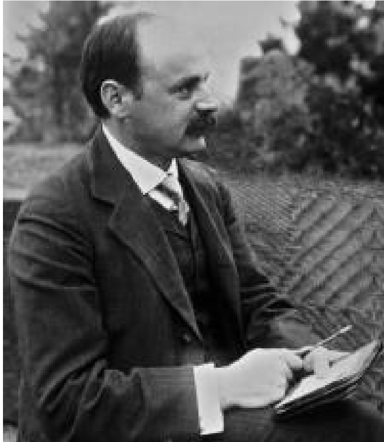
Fig. 4 Karl Schwarzschild in one of the few pictures available of him.

takes more than twice the exposure time to reach the same level of photographic density for twice as faint incident light). He derived an empirical formula describing the relation between exposure (brightness multiplied by exposure time) and the resulting photographic density. Already in 1901, after a second period in München, he was appointed professor and director of the Sternwarte in Göttingen. His most important work at that time was the Göttingen Actometrie 2 , a survey of stellar magnitudes between the celestial equator and +20^\circ declination, replacing his method of out-of-focus exposures by a new method based on a regular shaking of the plate during exposure to distribute the light over a larger area of emulsion. The instrument developed for this was called a Schraffierkassette .