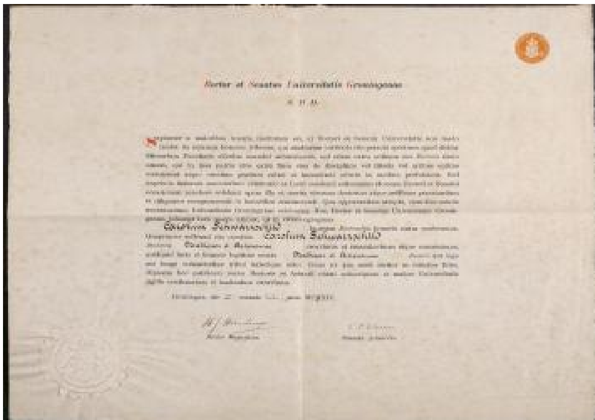
Fig. 6 Diploma or ‘doctoral bull’ for the honorary degree of Karl Schwarzschild from the University of Groningen in 1914 [14]

Mathematically this is an integral, which can be evaluated in principle in a straightforward manner. But the solution required is the inverse. Given the form of the luminosity curve and the star counts at apparent magnitudes, the problem is to determine the total density as a function of distance. That means ‘inverting’ the integral and inversion of integral equations is notoriously difficult. Now in 1912 Karl Schwarzschild, being interested in this problem, possibly since he was a student after all of von Seeliger, had developed a method to solve this problem for the case that the luminosity curve was a Gaussian function (see Fig. 5). Of course this was of enormous importance to Kapteyn. Indeed, later in 1920 he and van Rhijn chose the Schwarzschild method to solve for the distribution of stars in space, which resulted in the Kapteyn Model. 3